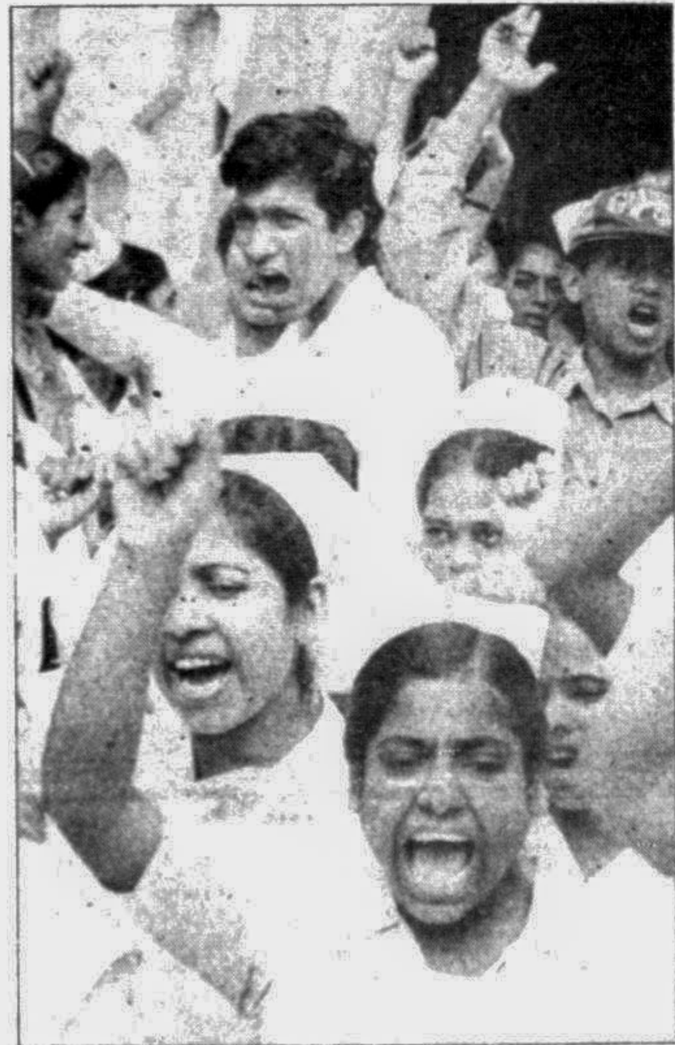
Nurses brought out a procession in the city yesterday on the first day of their indefinite strike.