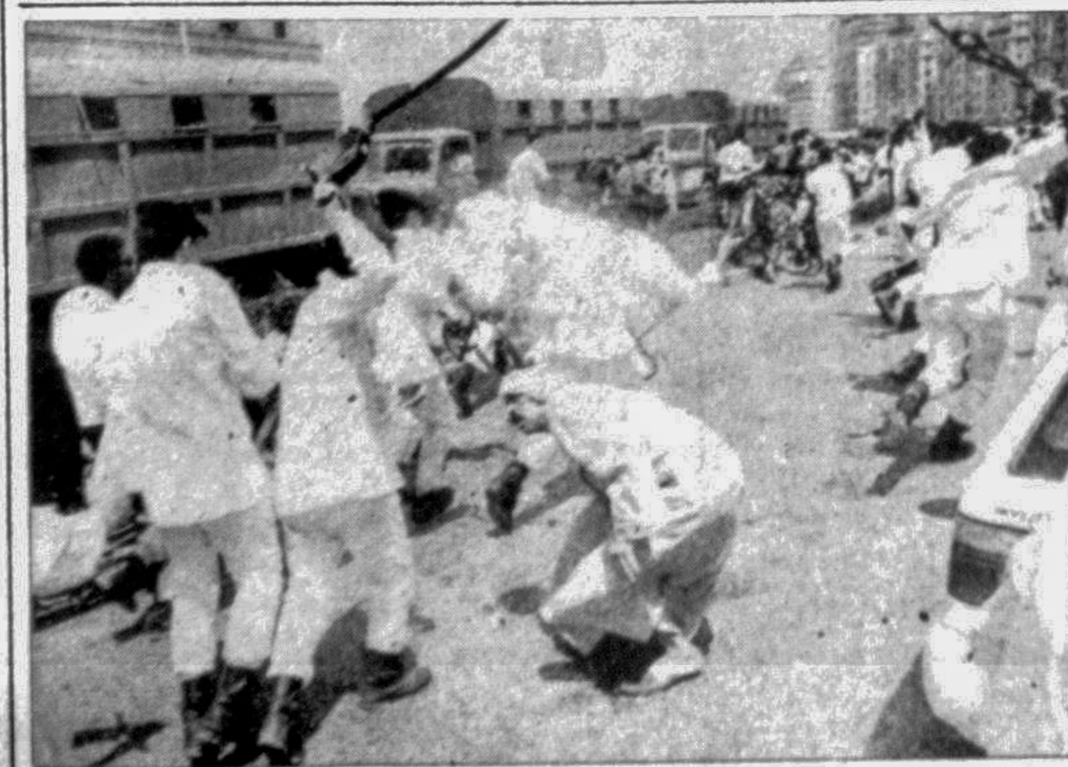
Egyptian security forces disperse a crowd of onlookers at the American University yesterday, after an attack by suspected Muslim militants on Interior Minister Hassan al-Aly in central Cairo which killed up to seven people and wounded 10, most of them critically.