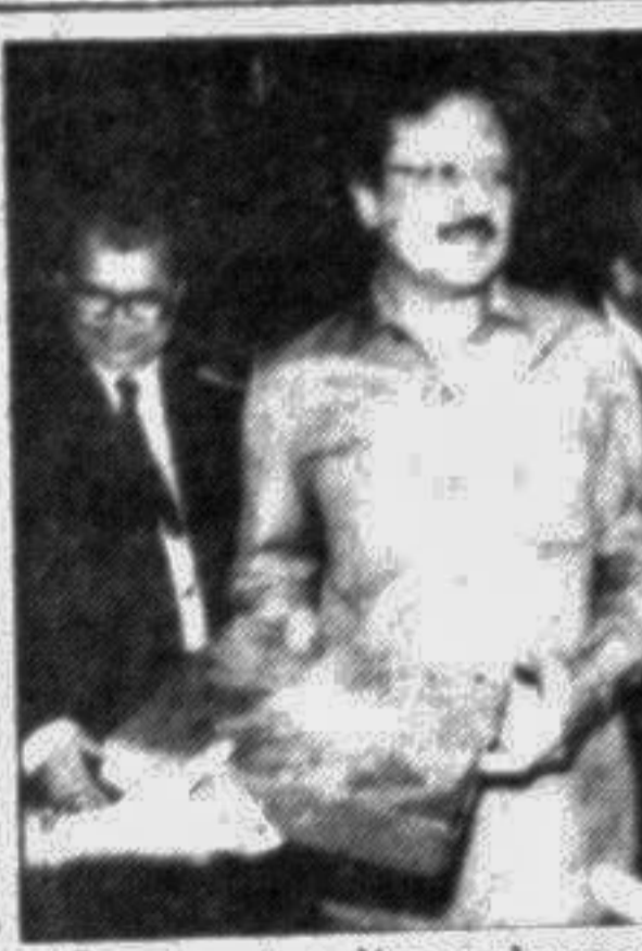
Guests at a dinner hosted by the Chairman and members of the Board of Directors of the National Credit and Commerce Bank Limited at Sonargaon Hotel Monday evening.