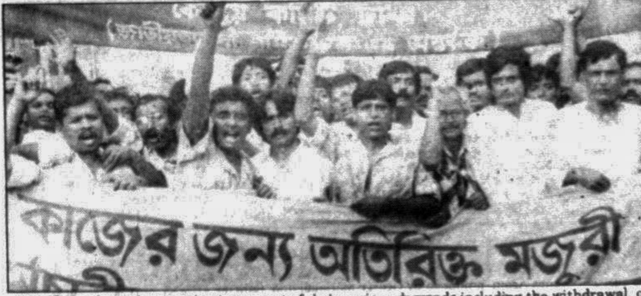
A bank employees' procession in support of their various demands including the withdrawal of new banking hours in the city yesterday.