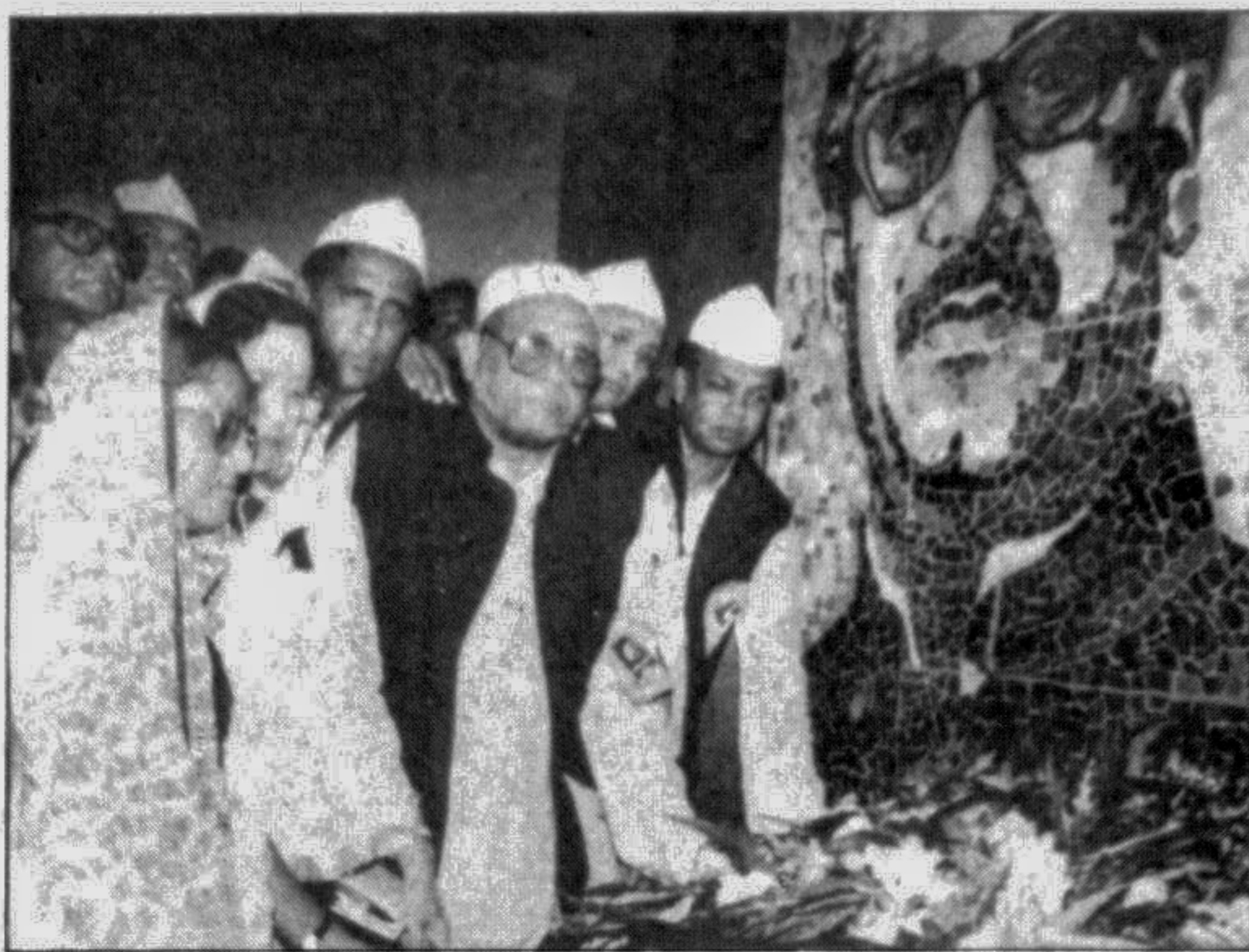
Awami League chief Sheikh Hasina, along with some senior leaders of her party, placed wreaths before a portrait of Sheikh Mujibur Rahman on his 18th death anniversary at the Dhanmondi Bangabandhu Bhavan in the city yesterday.

Combat was continuing in all three areas and Armenian commanders said Azerbaijan had launched the offensive to protect a strategic road linking Dzhebrail, Fizuli and regions near Martuni.