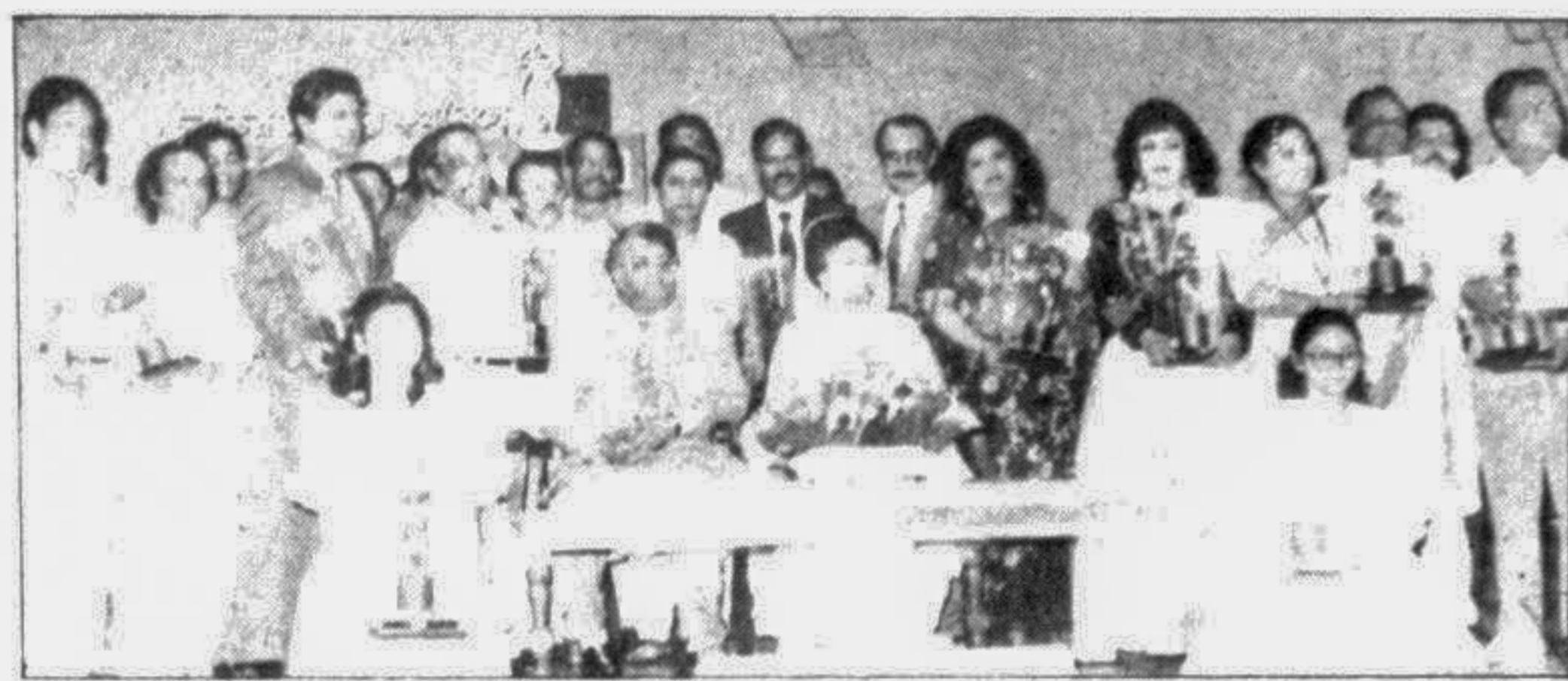
Prime Minister Begum Khaleda Zia with the recipients of National Film Awards for 1989, 90 and 91 at the Osmani Memorial Auditorium in the city yesterday.