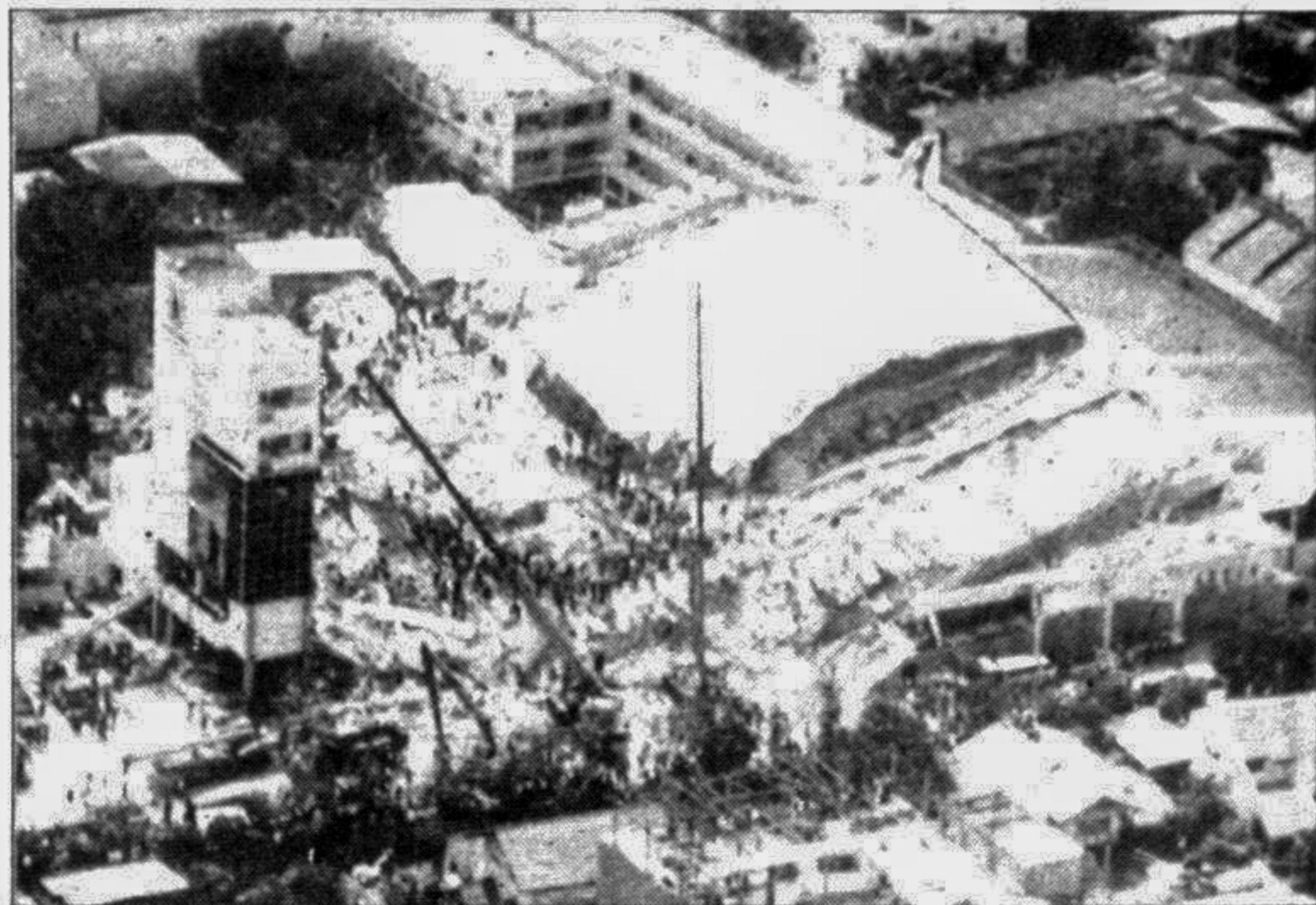
An overview of the ruins of the six-storey Royal Plaza Hotel in Nakhon Ratchasima, Northern Thailand, that collapsed yesterday.