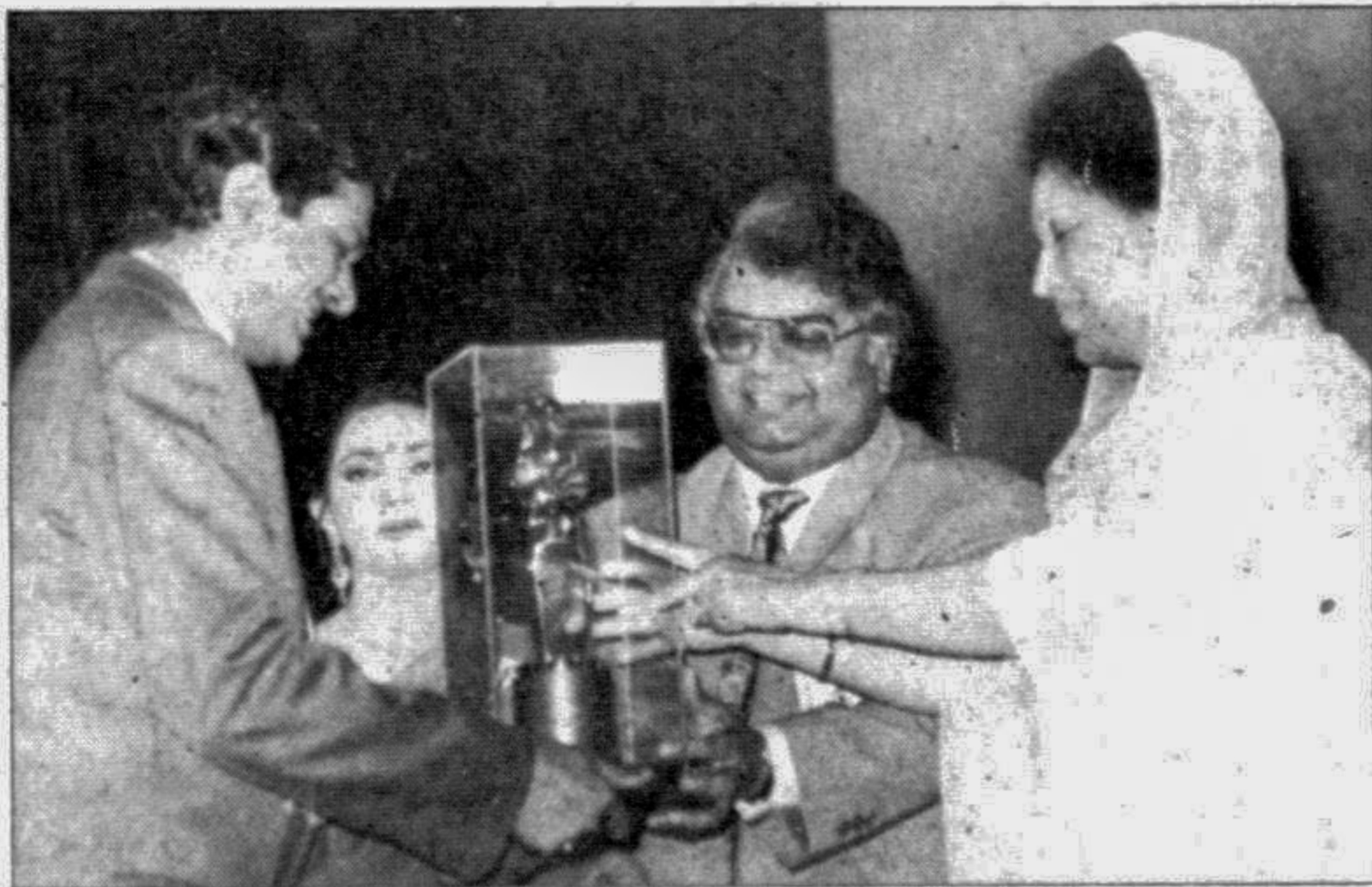
Prime Minister Begum Khaleda Zia presenting the Best Actor award to Alamgir during distribution of the National Film Awards for the years 1989, '90 and '91 at the Osmani Memorial Hall in the city yesterday. Information Minister Barrister Nazmul Huda is also seen.

The function, held at the Osmani Memorial Hall, was addressed by Information Minister Nazmul Huda. Information Secretary Nooruddin Al-Masud See Page 12 Col 5.