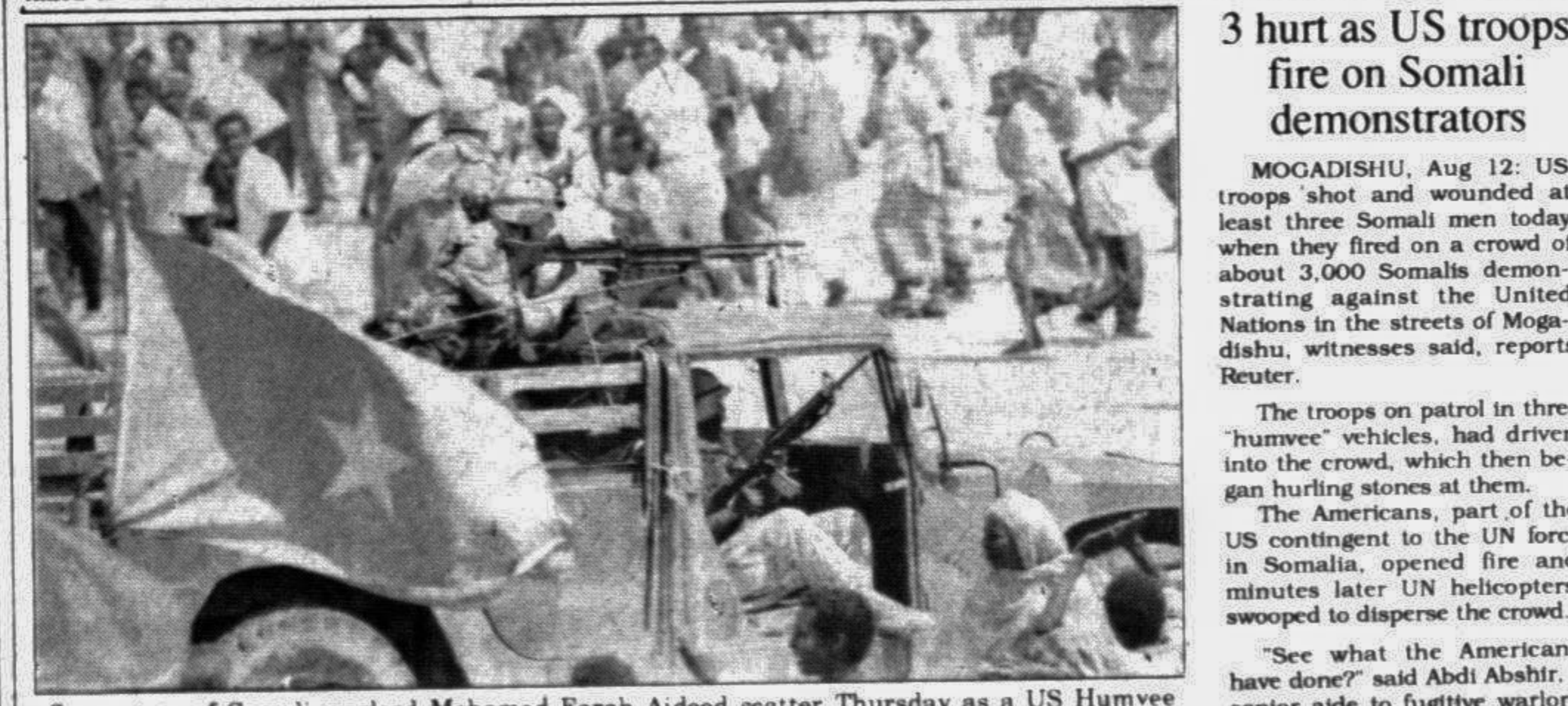
Supporters of Somali warlord Mohamed Farah Aided scatter Thursday as a US Humvee (machine-gun mounted jeep) drives through their demonstration on Lenin Avenue in Mogadishu. About 1,000 supporters had gathered when three Humvees appeared and forced their way through the crowd.