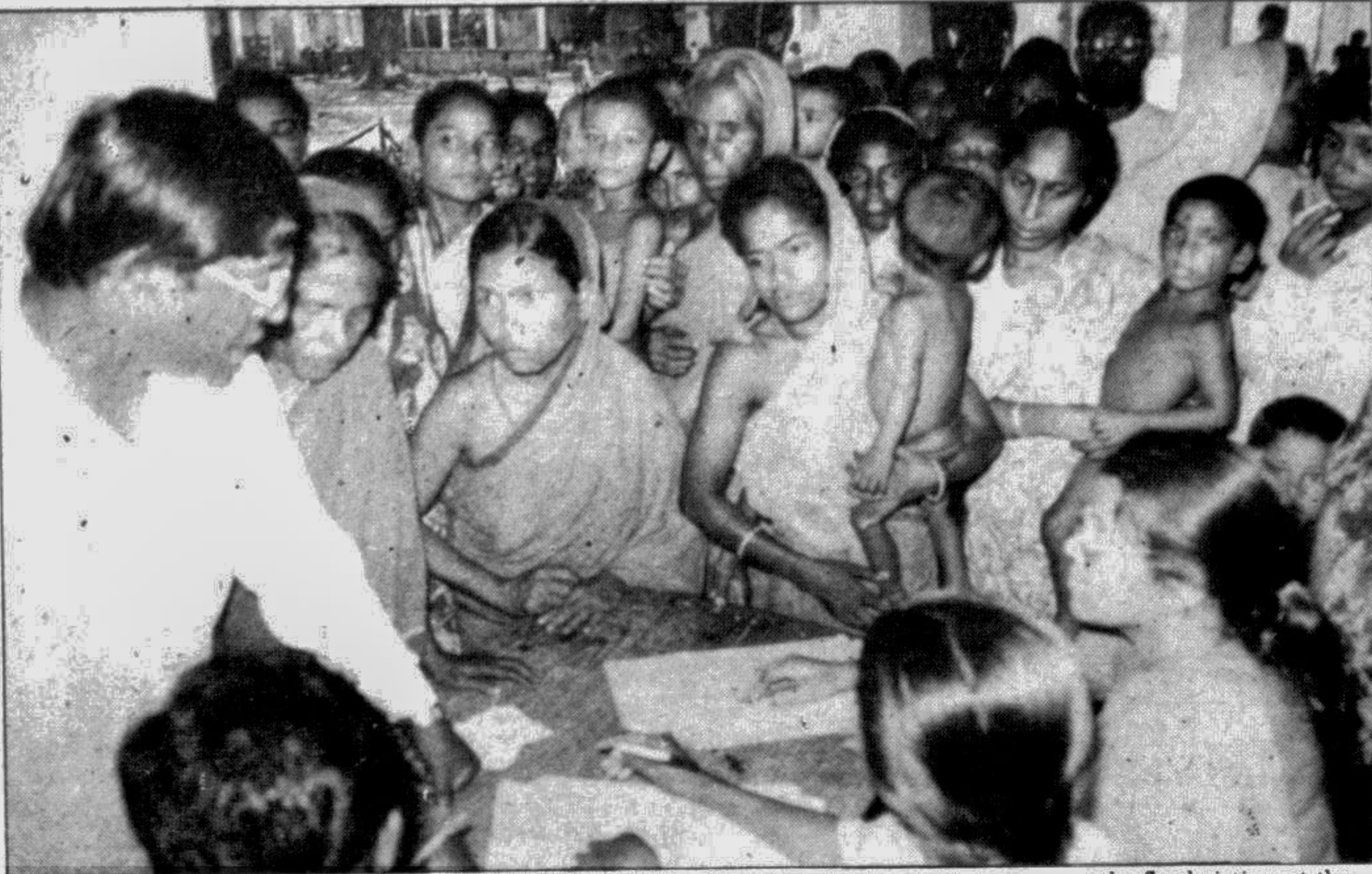
The field workers in presence of Dewan Afsaruddin, DC, Netrakona distributing medicines among the flood victims at the Anjuman High School Camp, Netrakona recently.

About 30 people were killed by thunderbolts during the current monsoon in different parts of the district.