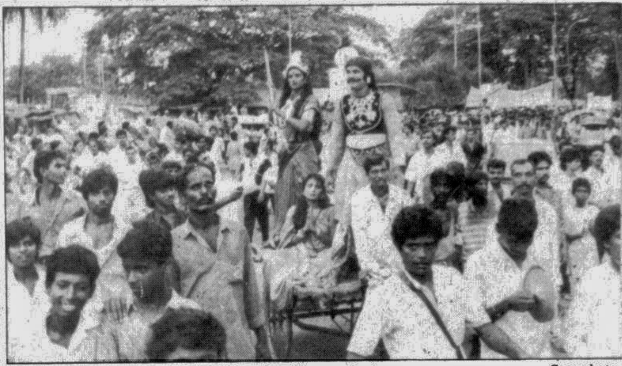
A rally in the city yesterday in celebration of Janmastami.