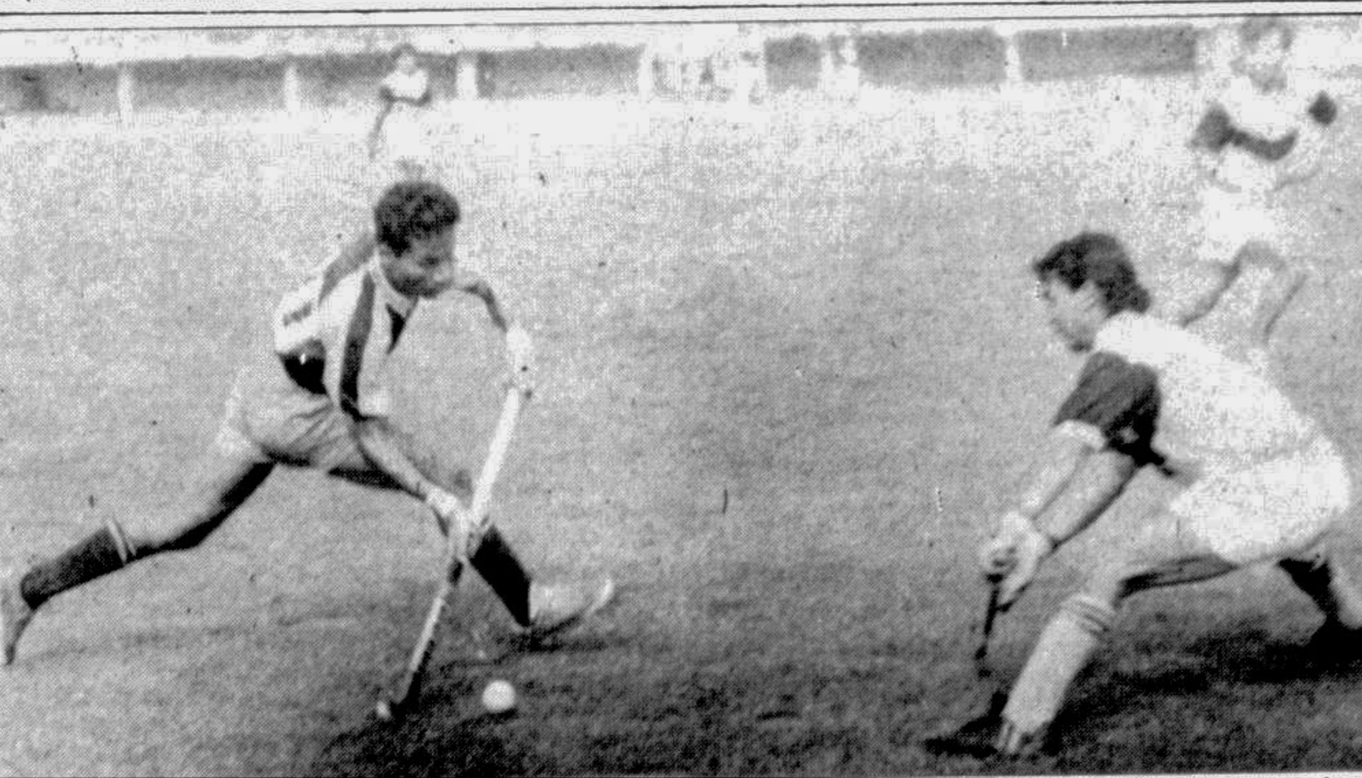
Action from yesterday's Green Delta First Division hockey league match between Bachelors Sporting Club and Bangladesh Railway at the Hockey Stadium. The match ended in a goalless draw.