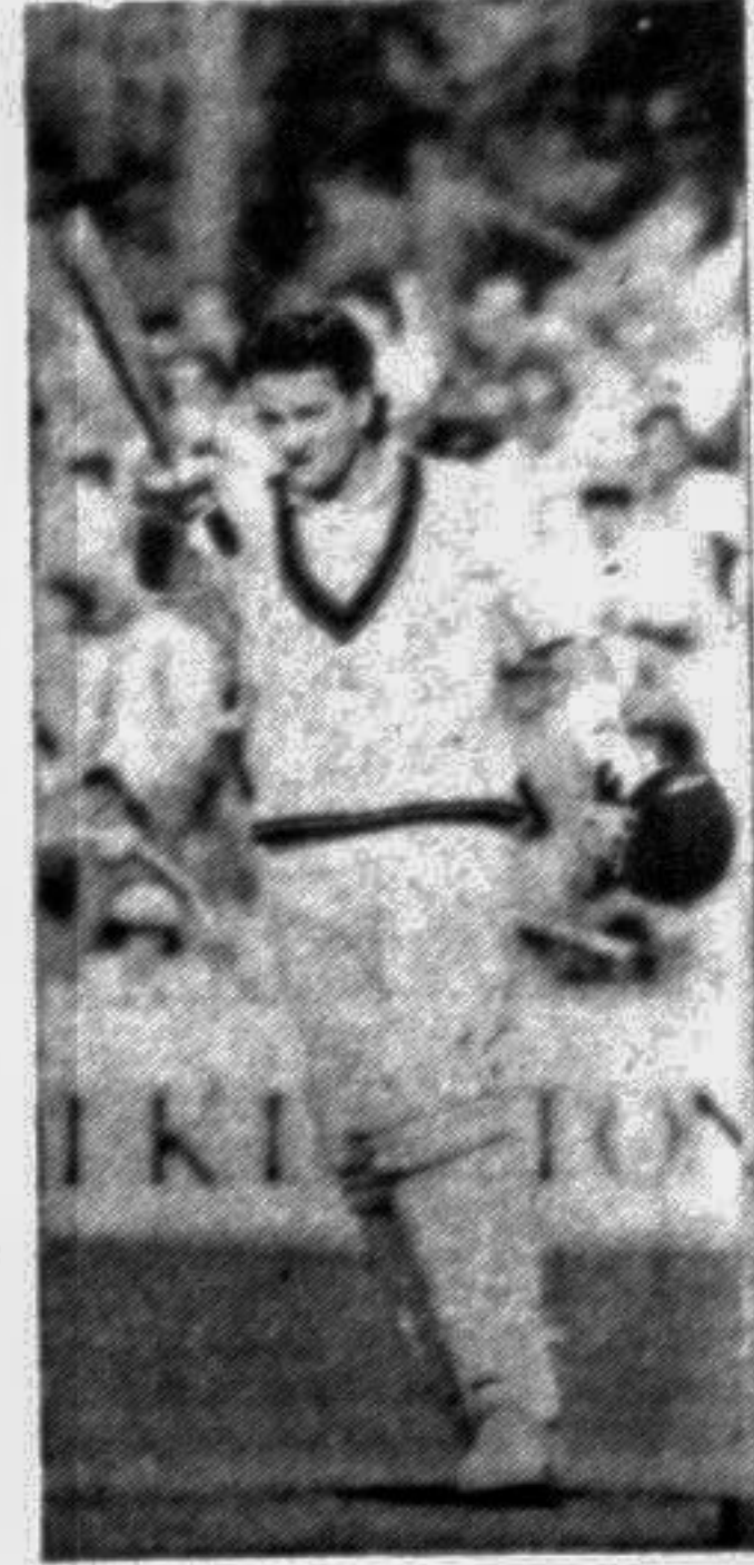
MARK WAUGH ... 62 n.o.

away. Boon increased the tempo with two fours in one