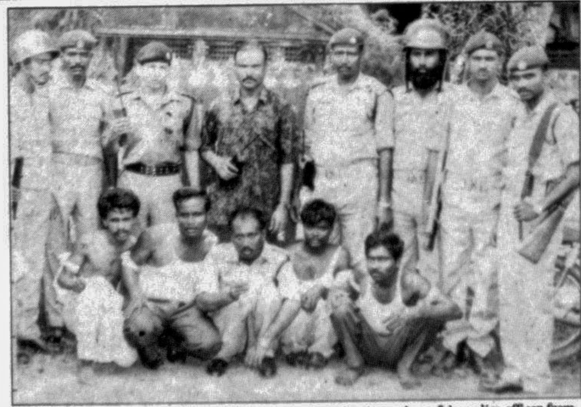
MYMENSINGH: Kotwali police recently arrested four dacoits and one fake police officer from the district.

According to experts, Barisal is still one 'diarrhoea zone' and the ratio of 'coliform' — a waterborne bacteria, is much higher in supply water in this poura area than in other districts of Barisal division. There are 16 water supply centres in Barisal including eight overhead water tanks.