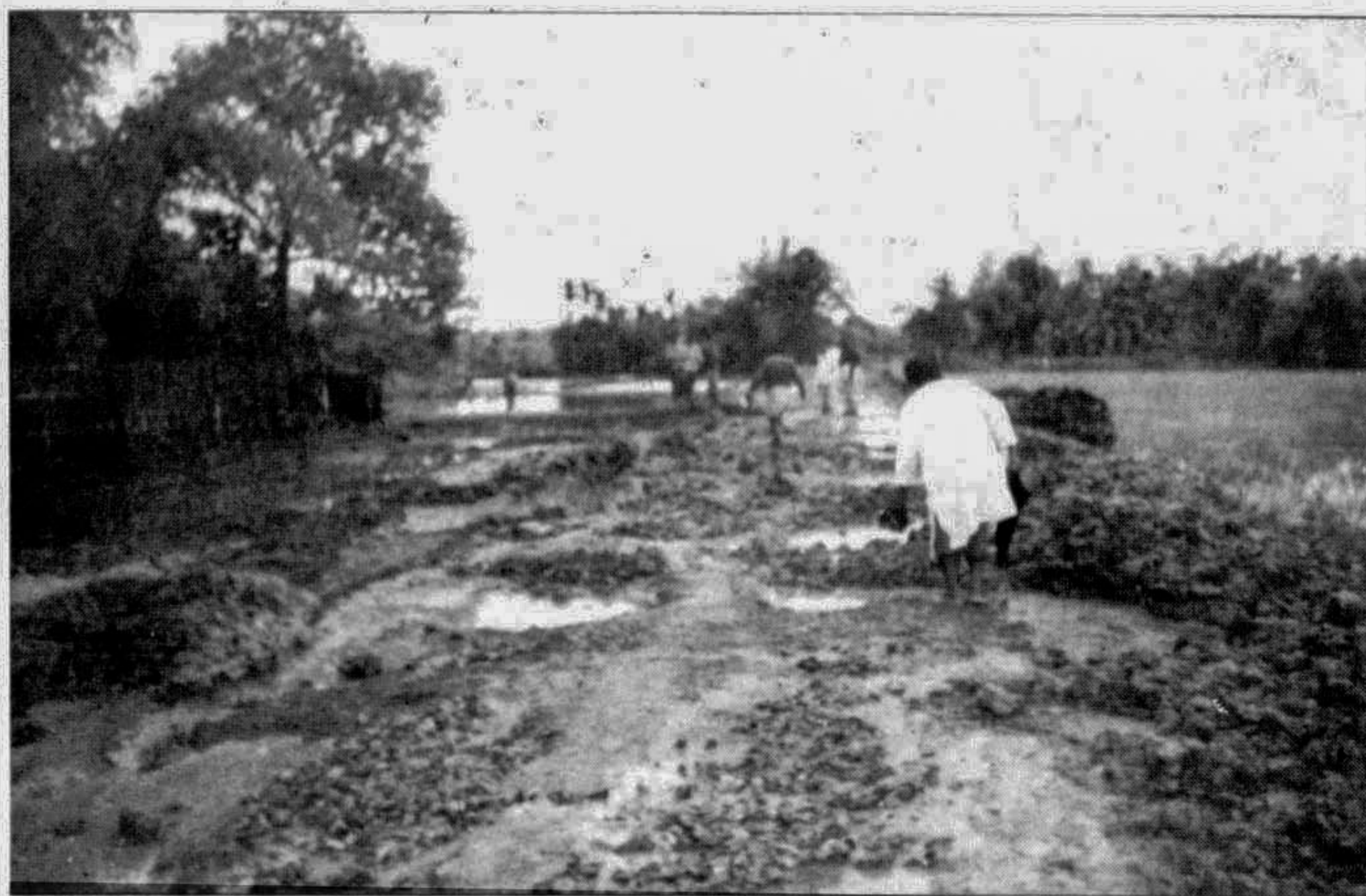
MAULVIBAZAR: The pitiable condition of Juri — Fultala road of the district. The road has been severely damaged by recent flood.

AUG 8: Police recovered a country made pipe-gun including a rifle bullet from Suborhoph village in Sadar thana of the district last week, reports UNB. Acting on tip, Si Md Jakir Hossain, rushed to the spot and recovered the arms and ammunition from a banana tree of the same village. A case was filed with Narail police but none was arrested yet in this connection.