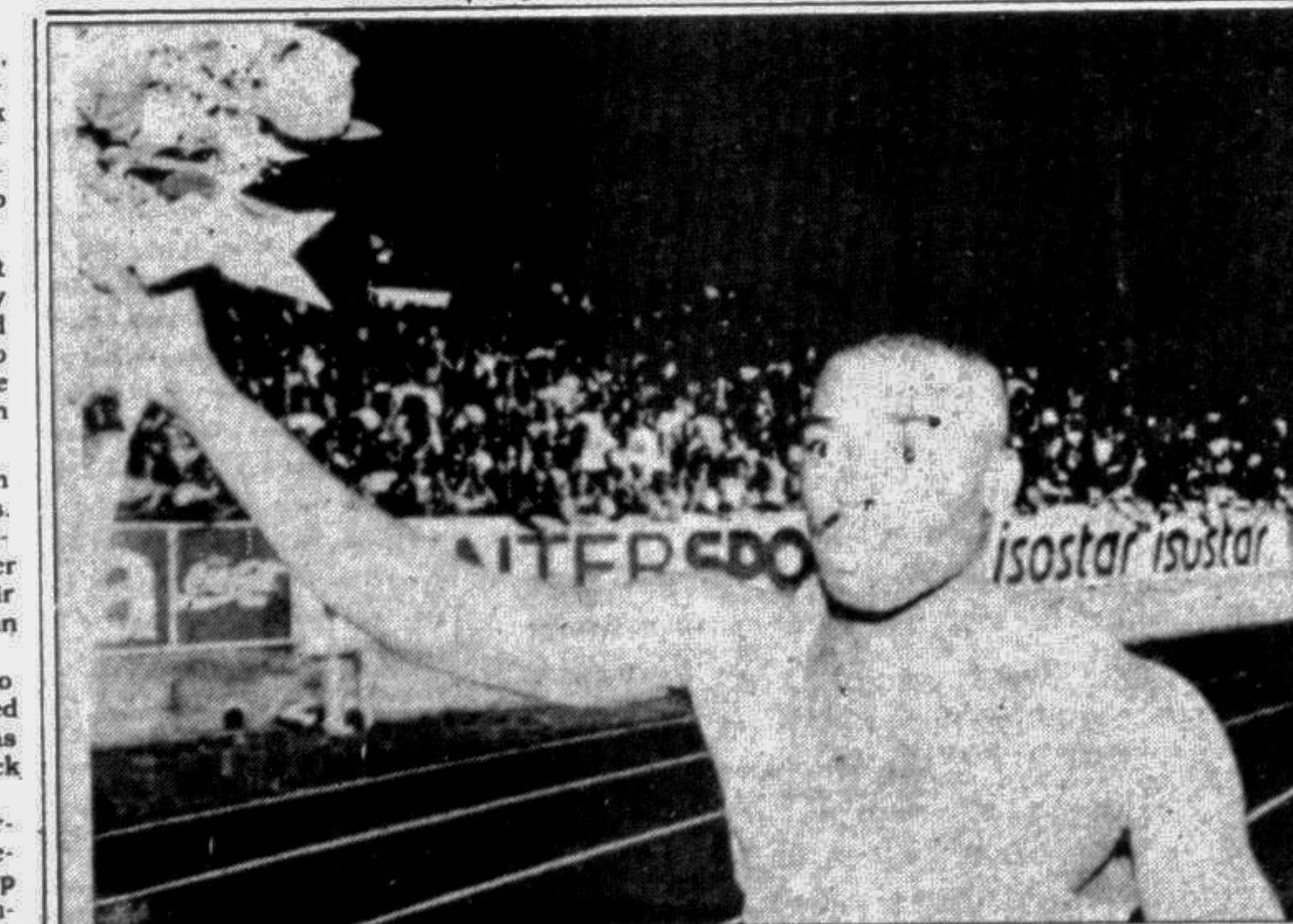
American Leroy Burrell waves to the crowd after winning the men's 100m sprint with a time of 10.02 sec at the Zurich track and field meeting on Aug 4.