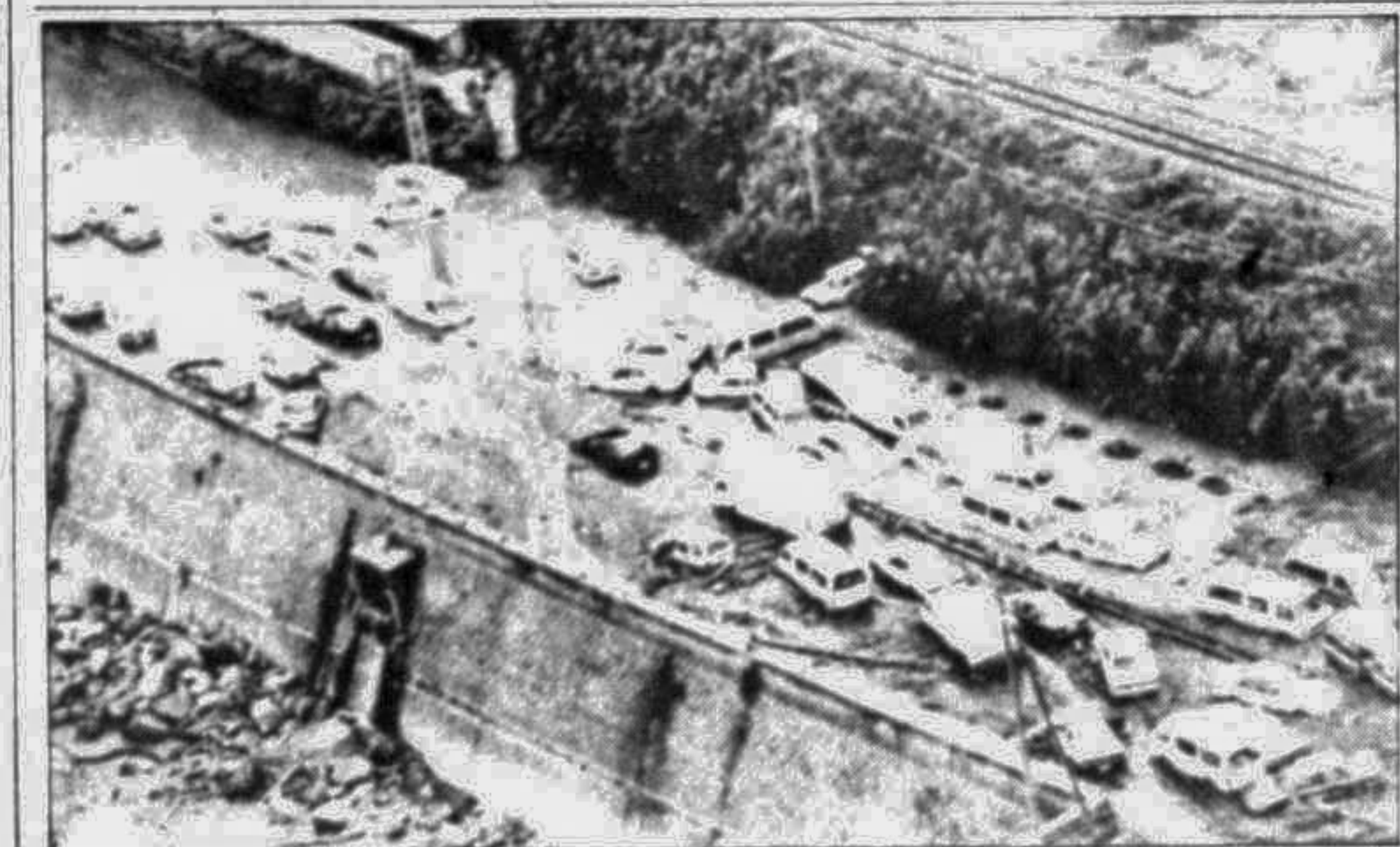
Cars and vans are left in the mud following heavy landslides caused by a storm which hit southern Kyushu island, Japan, yesterday.

Shevardnadze, in a characteristically doom-laden warning, told deputies Georgia's very existence was threatened unless power was centralised and an emergency regime brought in.