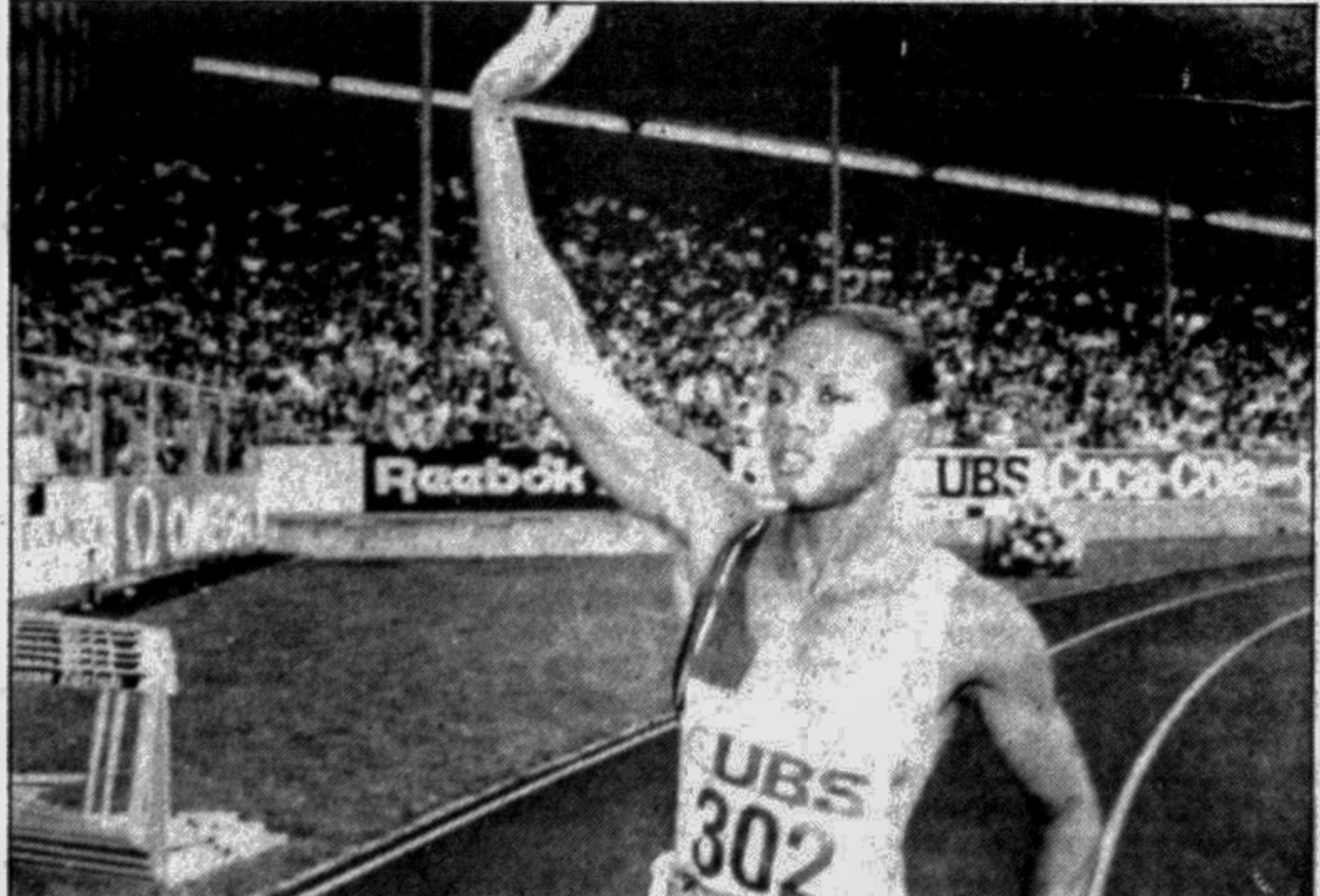
Merline Ottey of Jamaica greets the crowd after winning the 100m sprint with a time of 10.93 sec at the Zurich track and field meeting on August 4.

"It's hard playing them because there is so much emotional backing for them," he said after a bruising draw in Harare.