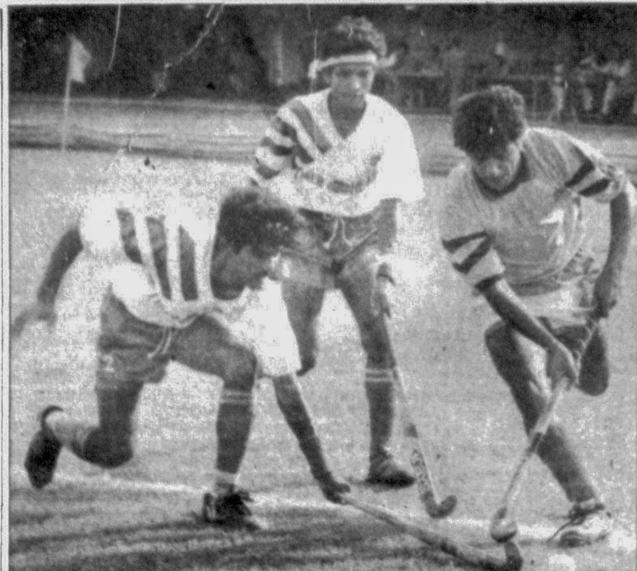
An Ajax player tries to work the ball past the lunged stick of two Usha players. Usha drubbed Ajax 5-2 in the lone Green Delta First Division hockey league encounter at the hockey stadium yesterday.

Polgar beat Spassky in a match organized by the same shadowy Yugoslav financiers who set up the Fischer-Spassky extravaganza.