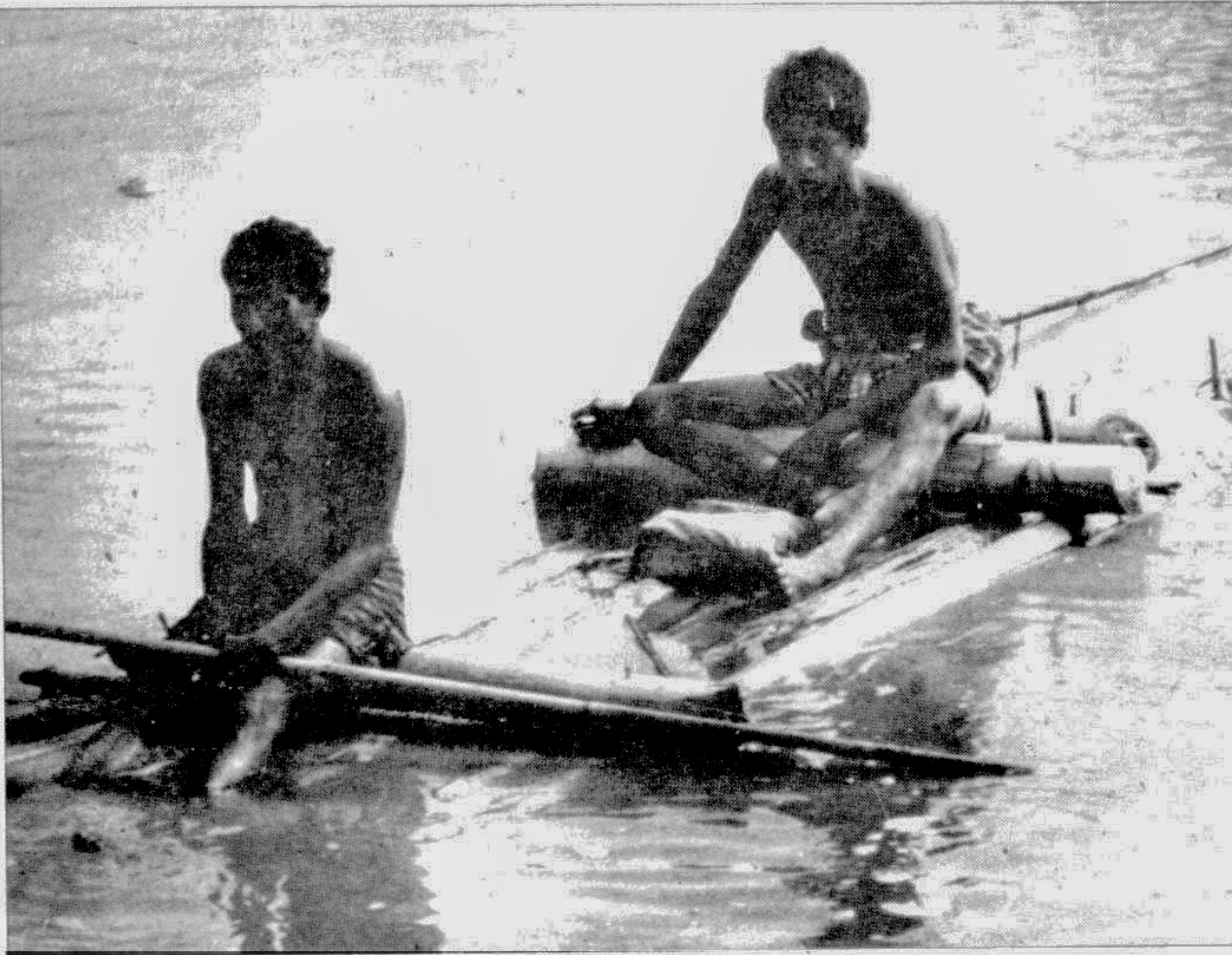
It is not a picture of flood. A man and a boy bringing Indian goods in polythene bags from Tripura by a raft through a river in Peni. Smugglers use various techniques to bring the contraband goods.

The board has listed 4,793 telephones for disconnections for non-payment of the arrears dues in the zone, an official source said.