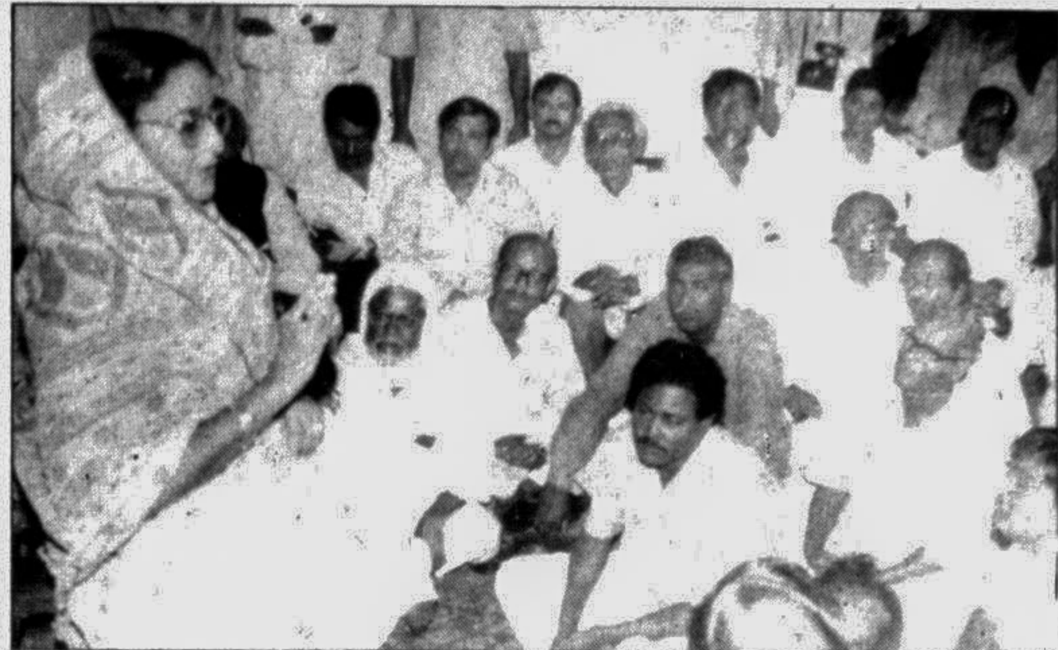
A delegation of Lawyers' Assistant Association yesterday met AL chief and Leader of the Opposition in Parliament Sheikh Hasina at her Minto Road residence and apprised her of their various problems.