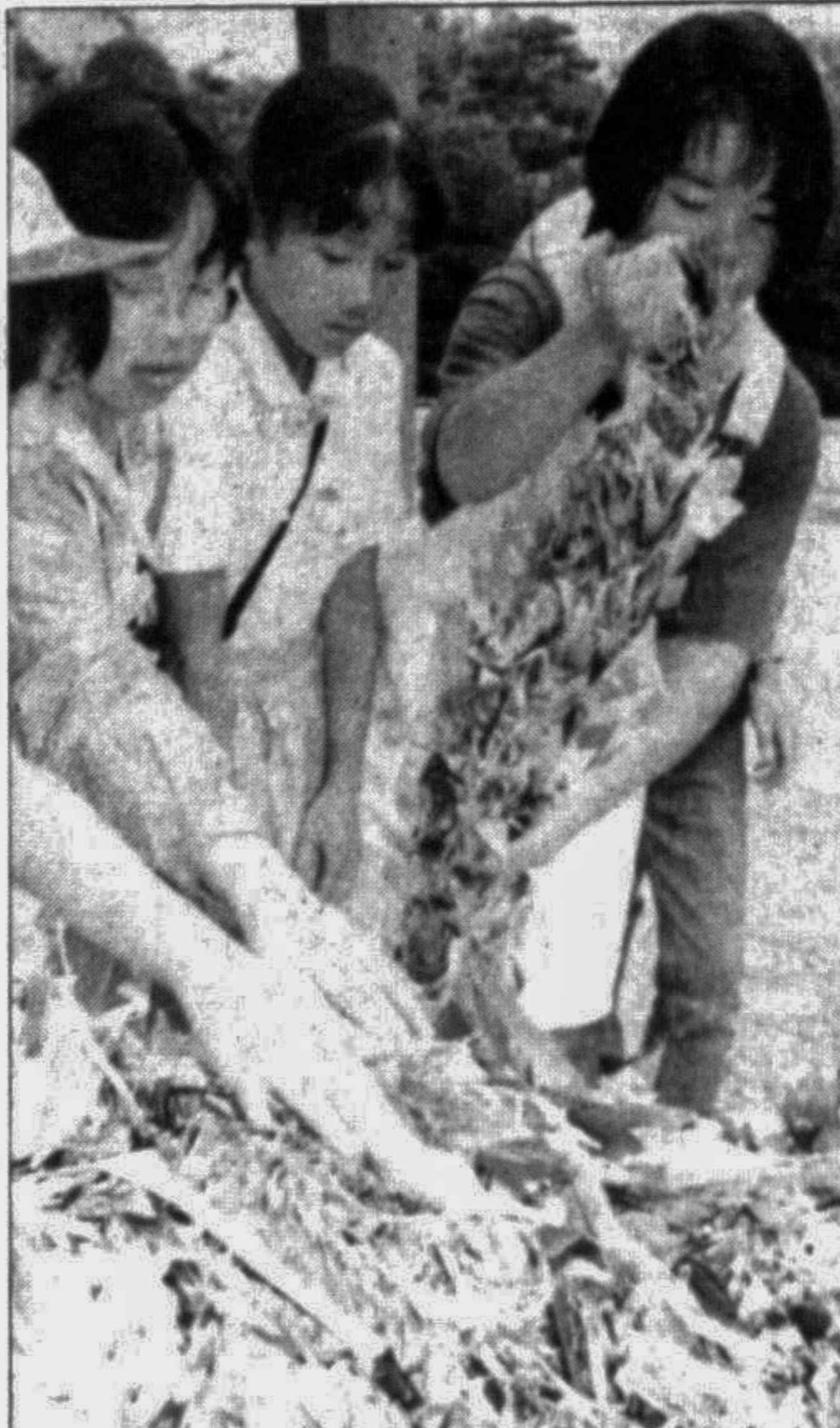
Children offer folded paper cranes as a memorial monument for atomic bomb victims at the Hiroshima Peace Memorial Park Friday. The annual peace memorial service will be held today, the 48th anniversary of the dropping of the bomb on Hiroshima August 6, 1945 which killed more than 20,000 people.

The BJC was set up by a government ordinance in 1985 by combining the services of the Jute Marketing Council, the Jute Trading Corporation, Bangladesh Jute Export Council and Rally Brothers. It was established to ensure fair prices to the jute growers, check smuggling and to stabilise the price.