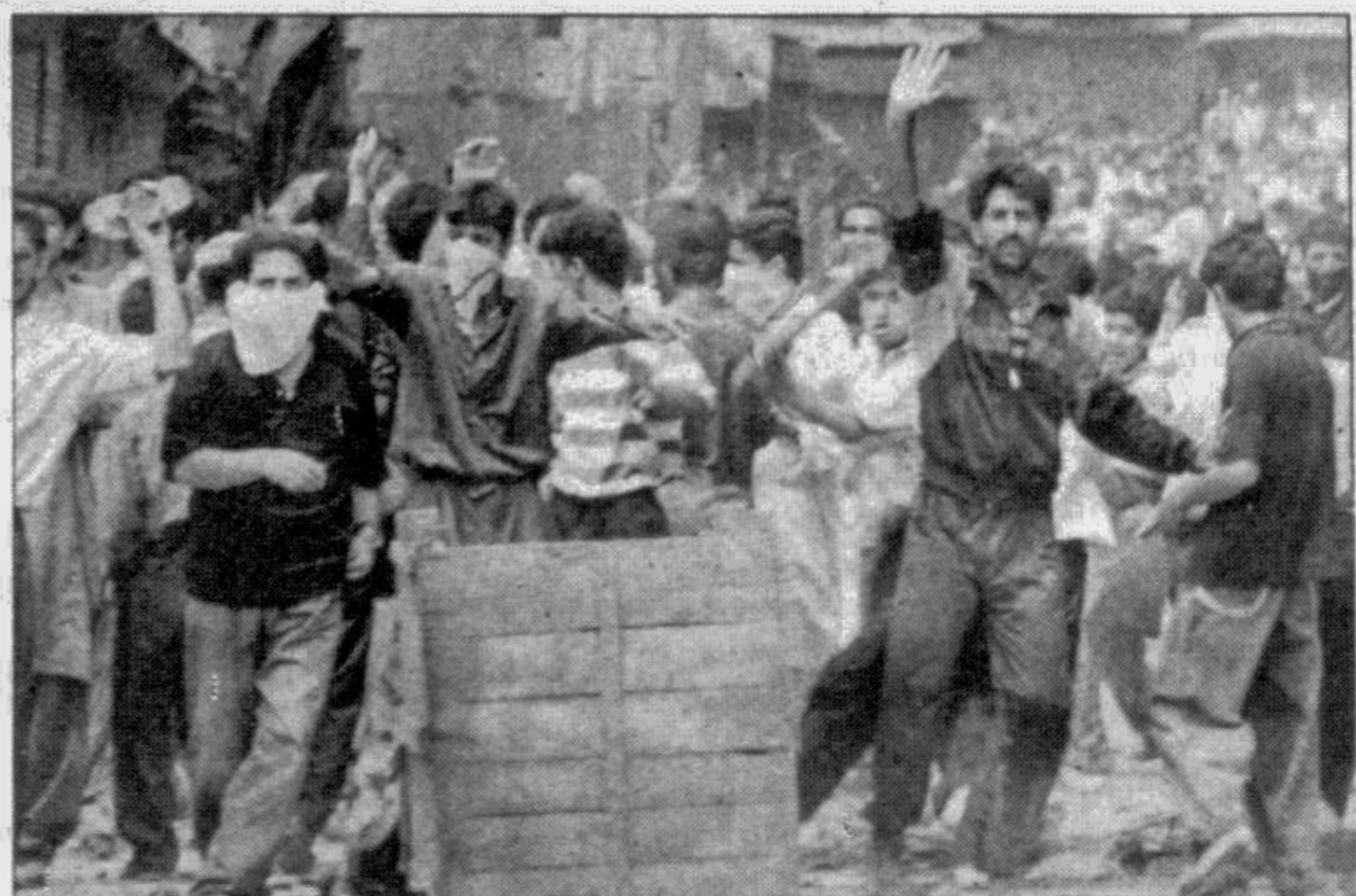
Kashmiri Muslims, defying curfew, shout anti-India and pro-independence slogans in protest Wednesday, two days after a Muslim family was killed by security troops. Thousands of people have taken to the streets to demonstrate against the killings.

Many members of the governing body of the private medical institution were unaware of any meetings or of the accounts, nor was there any