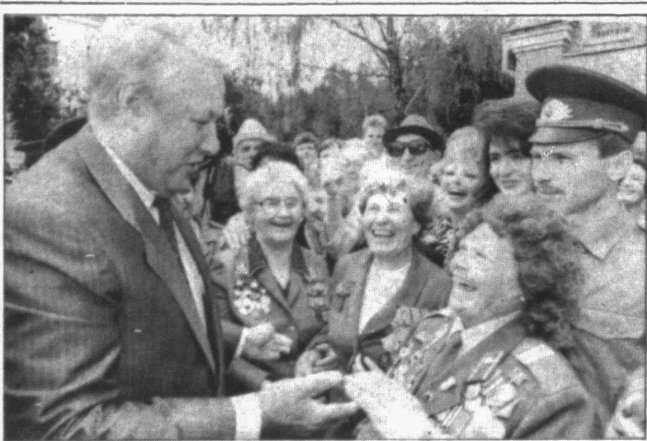
Russian President Boris Yeltsin (L) jokes with a group of World War II veterans as he joins in the celebrations to mark the 50th anniversary of the battle of Kursk on Wednesday. The President took time during his trip to meet local officials and also visited several farming communities.

LAGOS, Aug 5: Legislators in Northern Kaduna state have urged General Ibrahim Babangida not to hand over power to civilians on August 27 as scheduled, an official statement said Wednesday, reports AP.