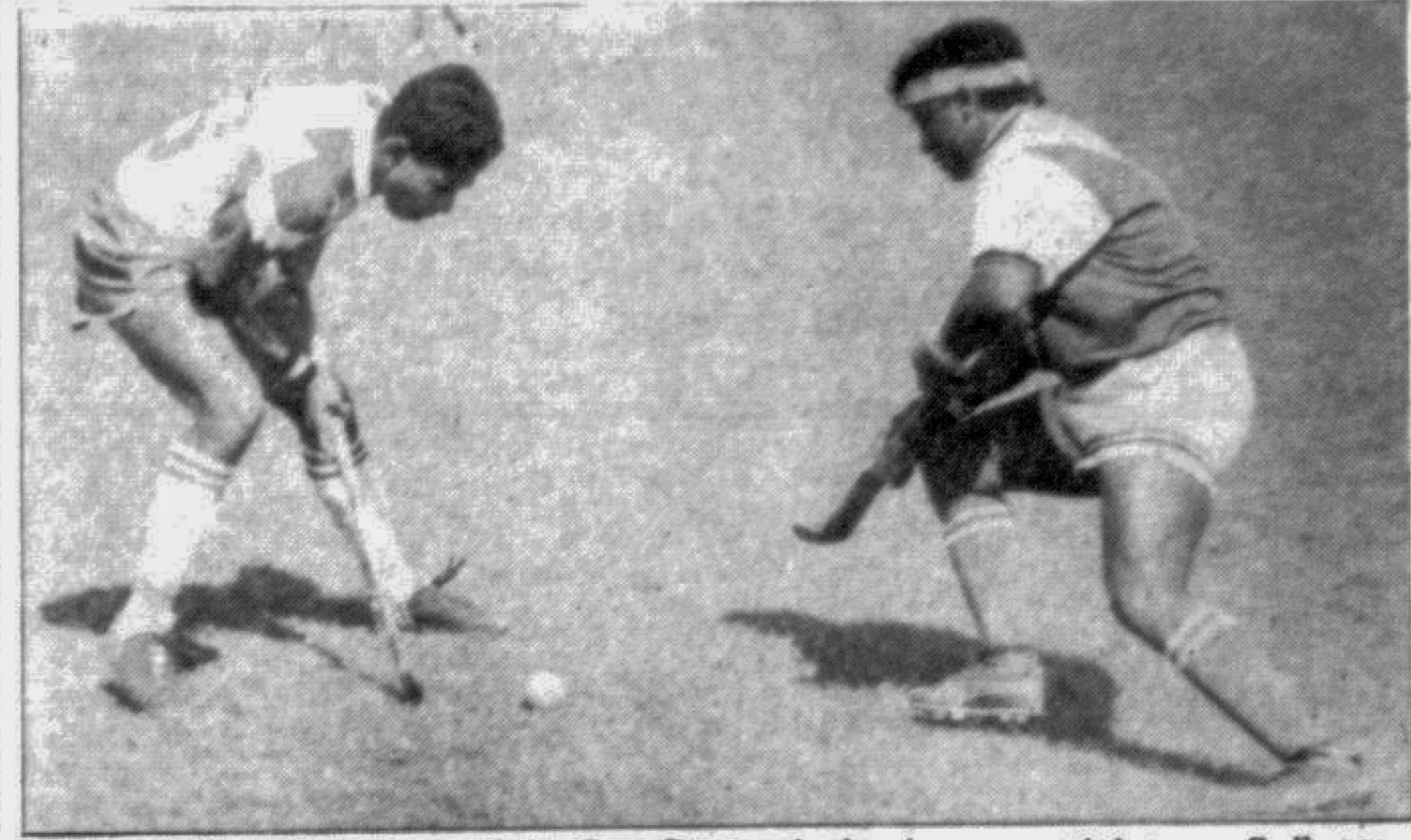
Action from yesterday's Green Delta First Division hockey league match between Sadharan Bima Krira Sangstha and Wari Club at the Hockey Stadium. The match ended in a one-all draw.

The Indian team has been assured by police that the bomb was not connected with their visit. They were also told it was not the work of the LTTE (Liberation Tigers of Tamil Eelam), a defence official said.