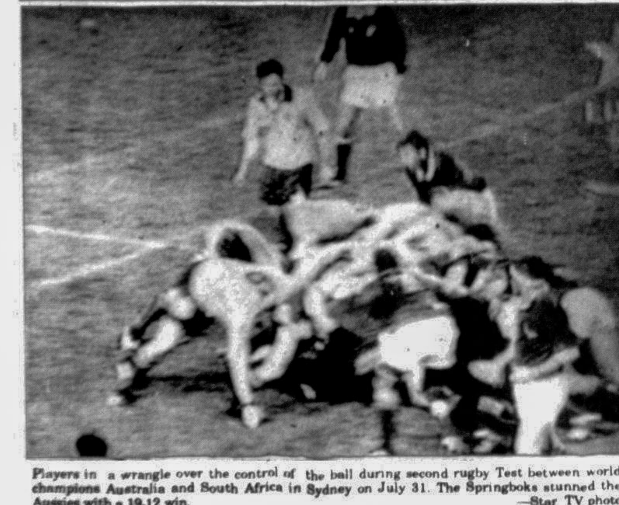
Players in a wrangle over the control of the ball during second rugby Test between world champions Australia and South Africa in Sydney on July 31. The Springboks stunned the Aussies with a 19-12 win.

CRYPTOQUIP S F B E M , E V D D H E U U A O M D V E M Y O T U E R Y E L U , T E F T , " S F Y O B R U E U P D L P T E U T U O E H ! " Yesterday's Cryptiquip: CARPET MANUFACTURER FINDS HE IS ABLE TO RETIRE BECAUSE HE MADE A NICE PILE. Today's Cryptiquip clue: F equals Y The Cryptiquip is a substitution cipher in which one letter stands for another. If you think that X equals O, it will equal O throughout the puzzle. Single letters, short words and words using an apostrophe give you clues to locating vowels. Solution is by trial and error.