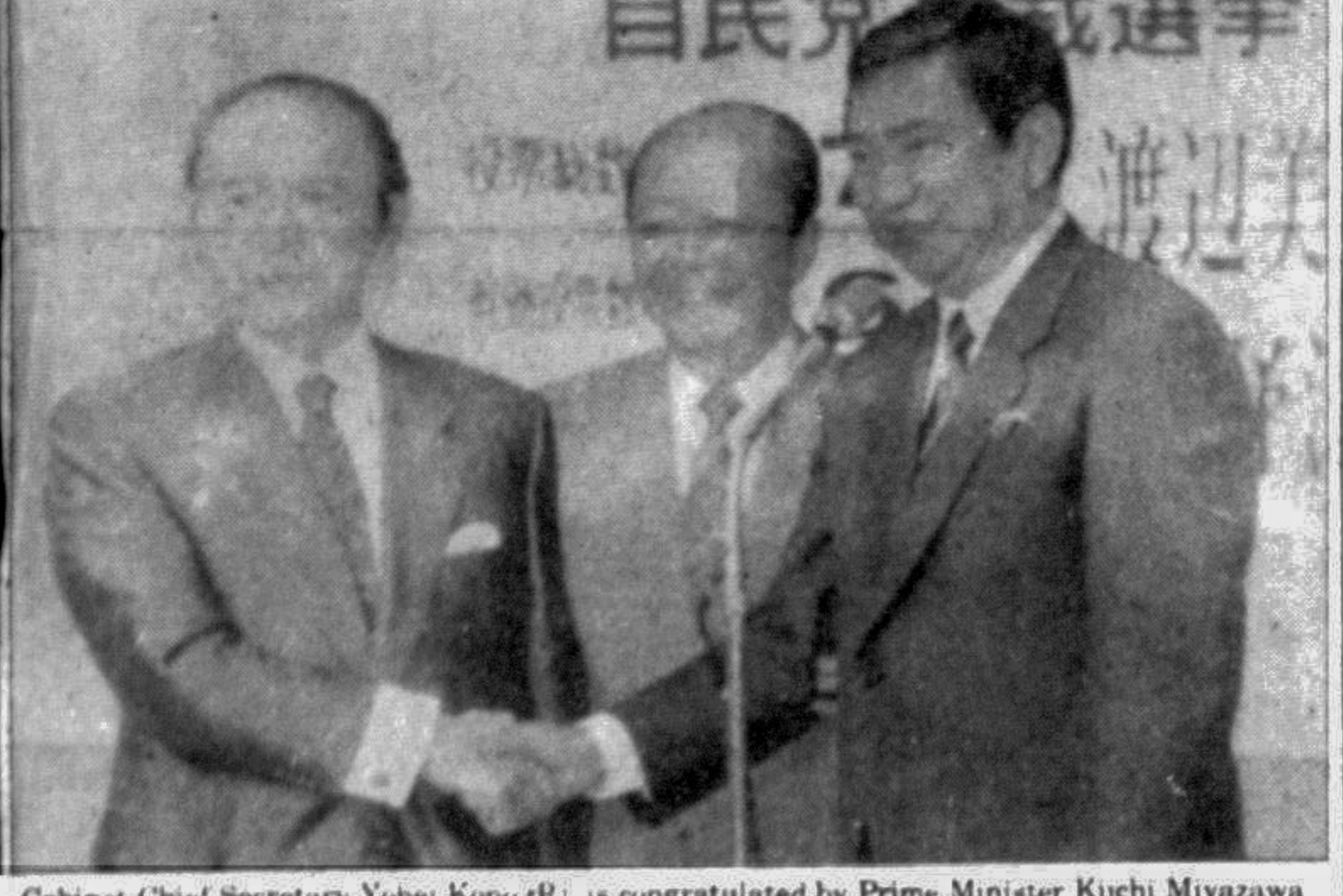
Cabinet Chief Secretary Yohei Kono (R) is congratulated by Prime Minister Kichi Miyazawa (C) and former Foreign Minister Michio Watanabe after Kono won the Liberal Democratic Party (LDP) presidential election in Tokyo yesterday.

From page 1 col 7 cess, the source explained. The ministry has also been facing some complications in appointing consultants for the construction works under the projects. According to another official source, many Project Directors are new and lack the requisite skills. Among the 100 projects undertaken by the ministry, 74 are investment projects while the rest 26 are for providing technical assistance. Among the development projects, work for implementation of at least five could not be begun during the year. One of these, the Human Research Development Project, is yet to be approved by the Planning Commission. Another project — the Maternal Child Health Training Institute, Azimpur — also remains unimplemented since the agreement with the donor concerned has not yet been signed.