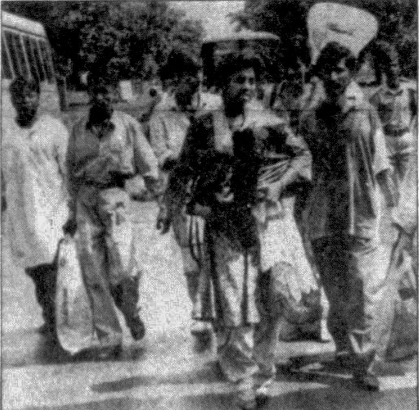
JU students, ordered to vacate their dormitories following Thursday's violent incident are seen leaving the campus yesterday.

HANGALBAG (India), July 30: At least 37 people, most of them civilians, were killed in fighting between pro-independence Muslim rebels and government troops in a resurgence of violence across Jammu-Kashmir state, officials said Friday, reports AP. Ten civilians were gunned down Friday when security forces fired upon a crowd of 300 villagers gathered in a field in Hangalbag, 60 kilometres (37 miles) south of capital Srinagar, witnesses said. Police and defence officials, however, said seven civilians were killed and four others injured when militants hiding in the crowd hurled a grenade during the search operation. Dozens of witnesses told The Associated Press on condition of anonymity that soldiers ordered them out of their houses after courting off the village. They suddenly heard the sound of gun shots. As the crowd scattered, many people shouted pro-independence slogans. Soldiers then began to beat up men, women and children. Ten people were injured, they said. According to a government statement, militants hiding in the area used the villagers as a cover to fire at the soldiers. Troops opened fire after a rebel shot at them with a pistol and another militant threw a grenade, it said. A defence spokesman said the civilians were all killed in the grenade attack. There were no casualties among the soldiers, said the spokesman.