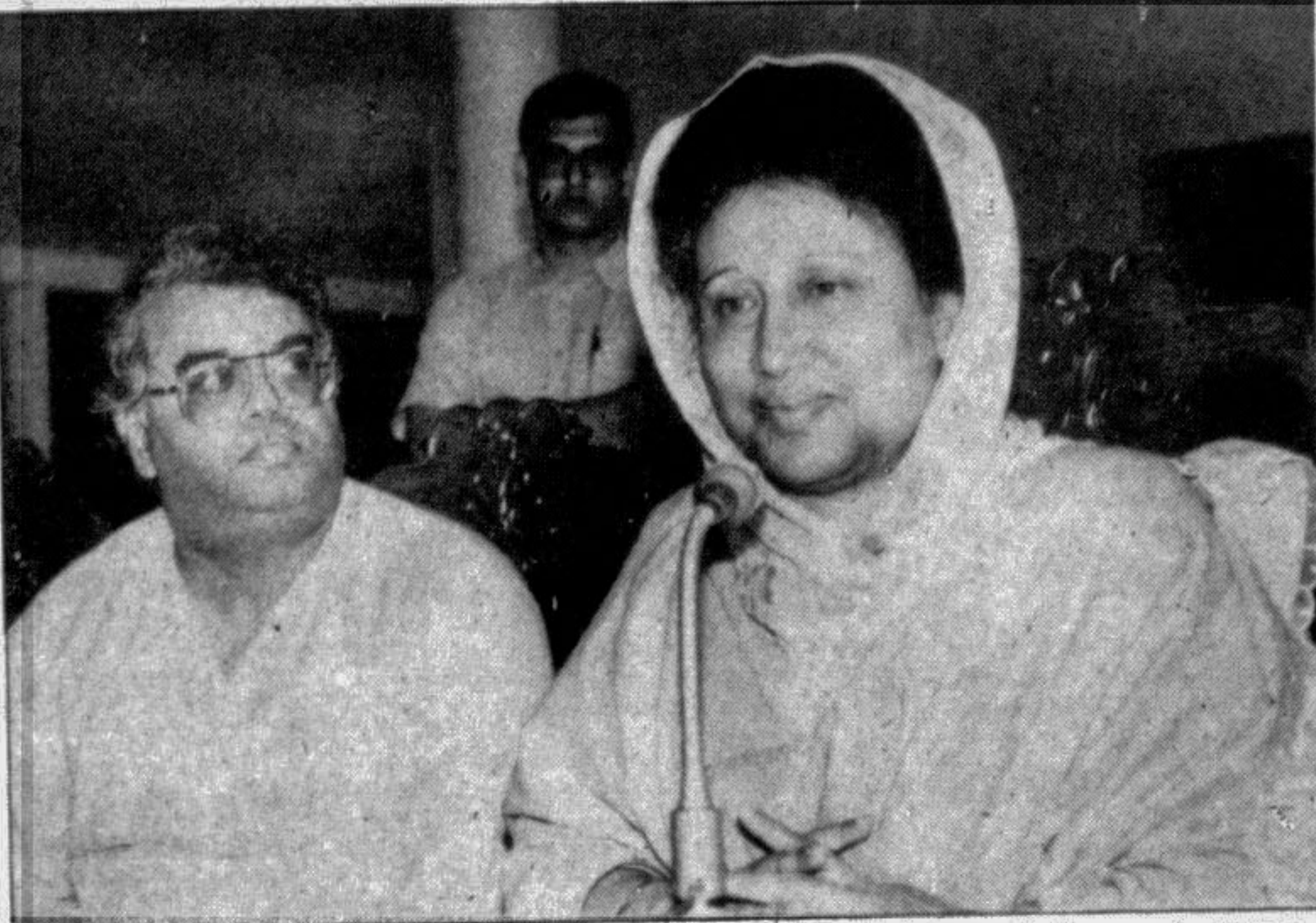
Prime Minister Begum Khaleida Zia addressing the leaders of Joypara College under Dohar Thana Chhatra Sangsad and students while they called on her at Sugandha on Thursday. Information Minister Barrister Nazmul Huda was present at the right.