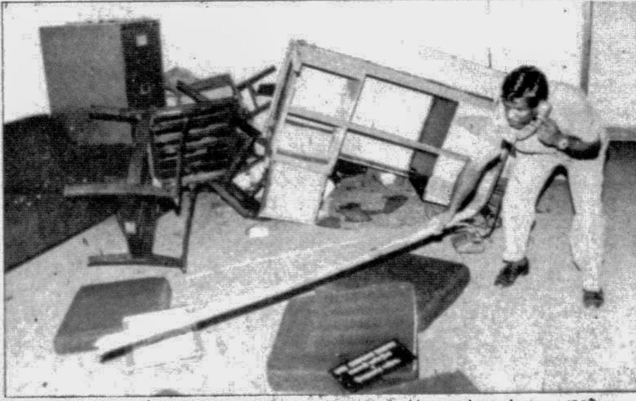
A Teachers' room of the Jahangirnagar University ransacked by unruly students yesterday.