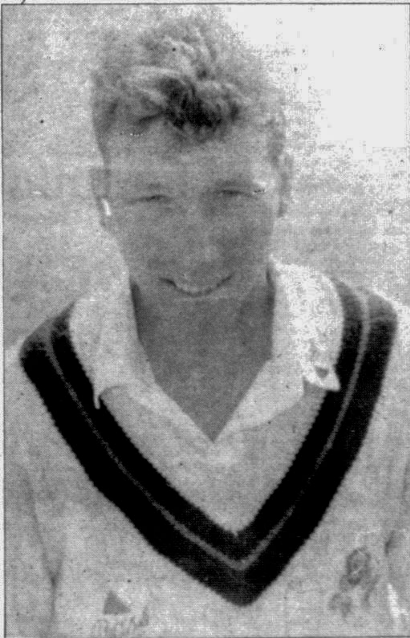
An AFP library picture dated April 1992 of Mike Atherton, who was named England cricket captain at a news conference at Regents Park Hotel, London yesterday. Atherton takes over from Graham Gooch, who stepped down after England's humiliating innings defeat at the hands of traditional rivals Australia in the fourth Test at Headingley on Monday.

will meet with the selectors to pick a team for the next Test against Australia, starting Aug 5 at Edgbaston.