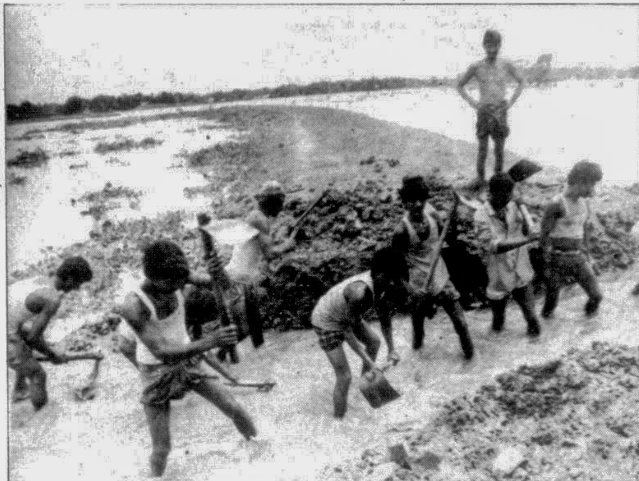
Flood-hit villagers provide their own solution by cutting a channel in the Netrakona town protection embankment Tuesday. Such desperate, often short-sighted measures, reported quite regularly from around the country during times of floods, cause more harm than good. One such incident in Zakiganj of Sylhet on July 26 led to an armed clash which left five people dead and scores of others injured when the BDR personnel had to open fire to prevent the cutting of a levy built with the country's scarce resources.