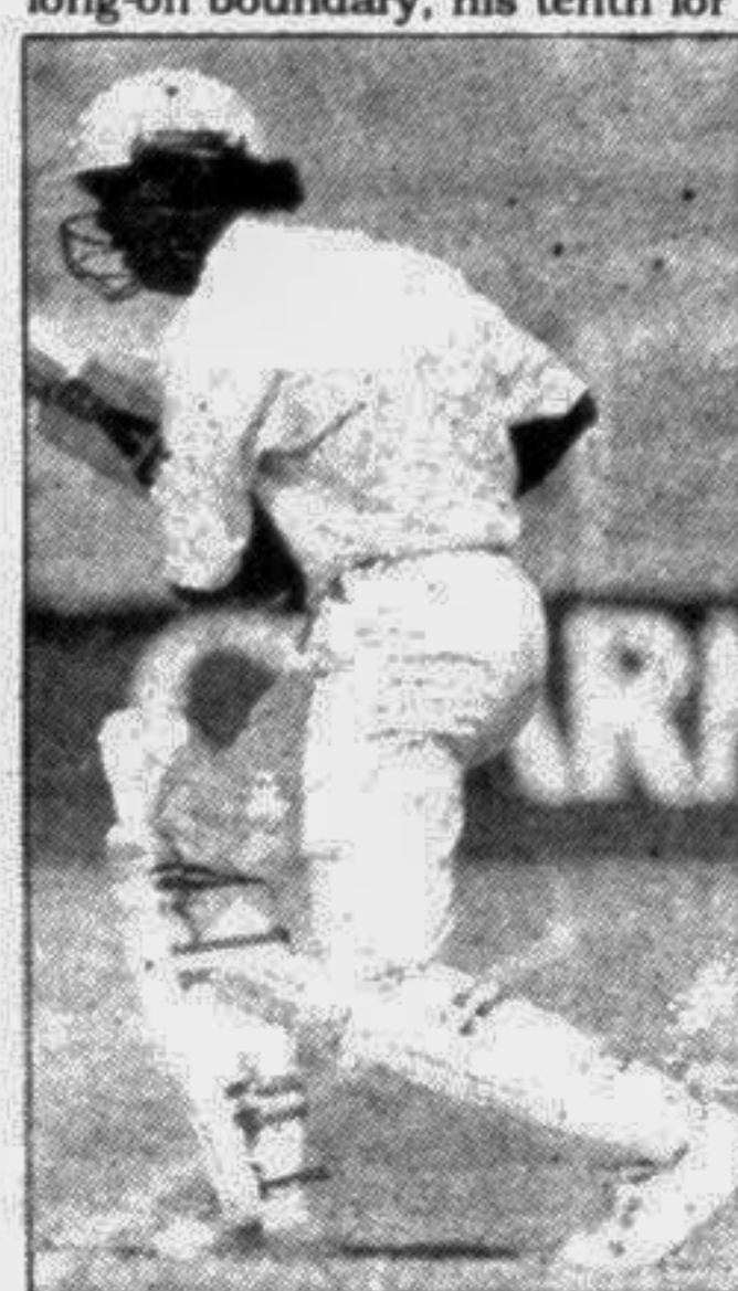
KAMBLI ... 119 n.o