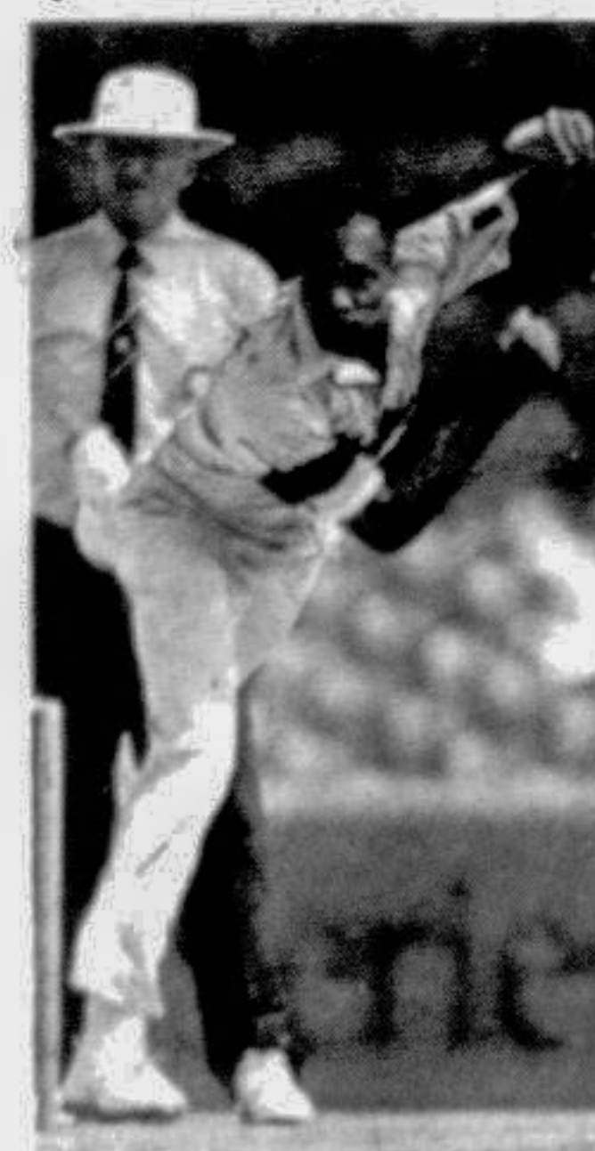
CUMMINS... 5 for 32

many years, moved up to second place behind Middlesex when they beat Worcestershire by one wicket with three balls to spare.