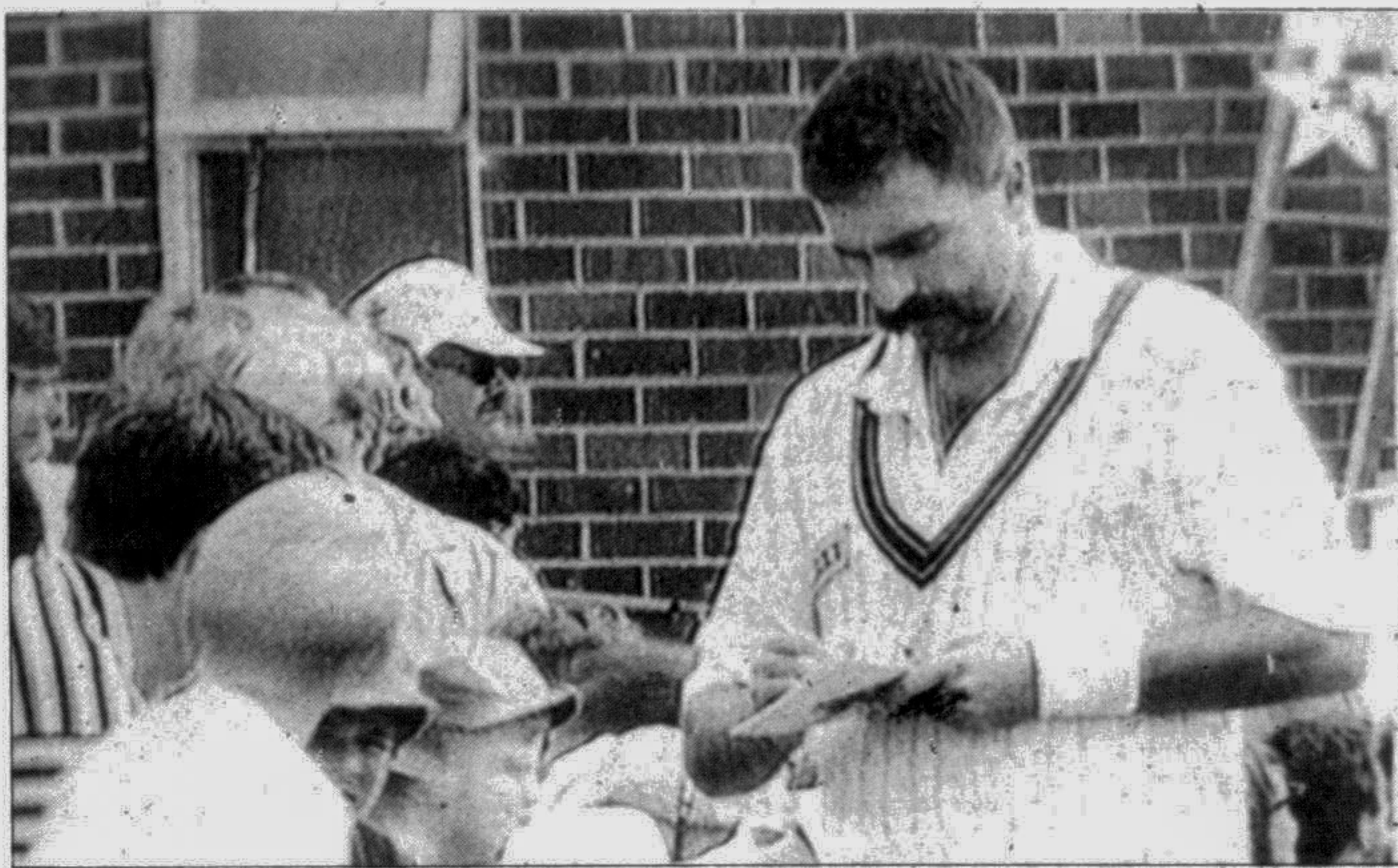
Not the most agreeable of opponents on the field Aussie paceman Merv Hughes is almost always the unmistakeable target of autograph hunters.