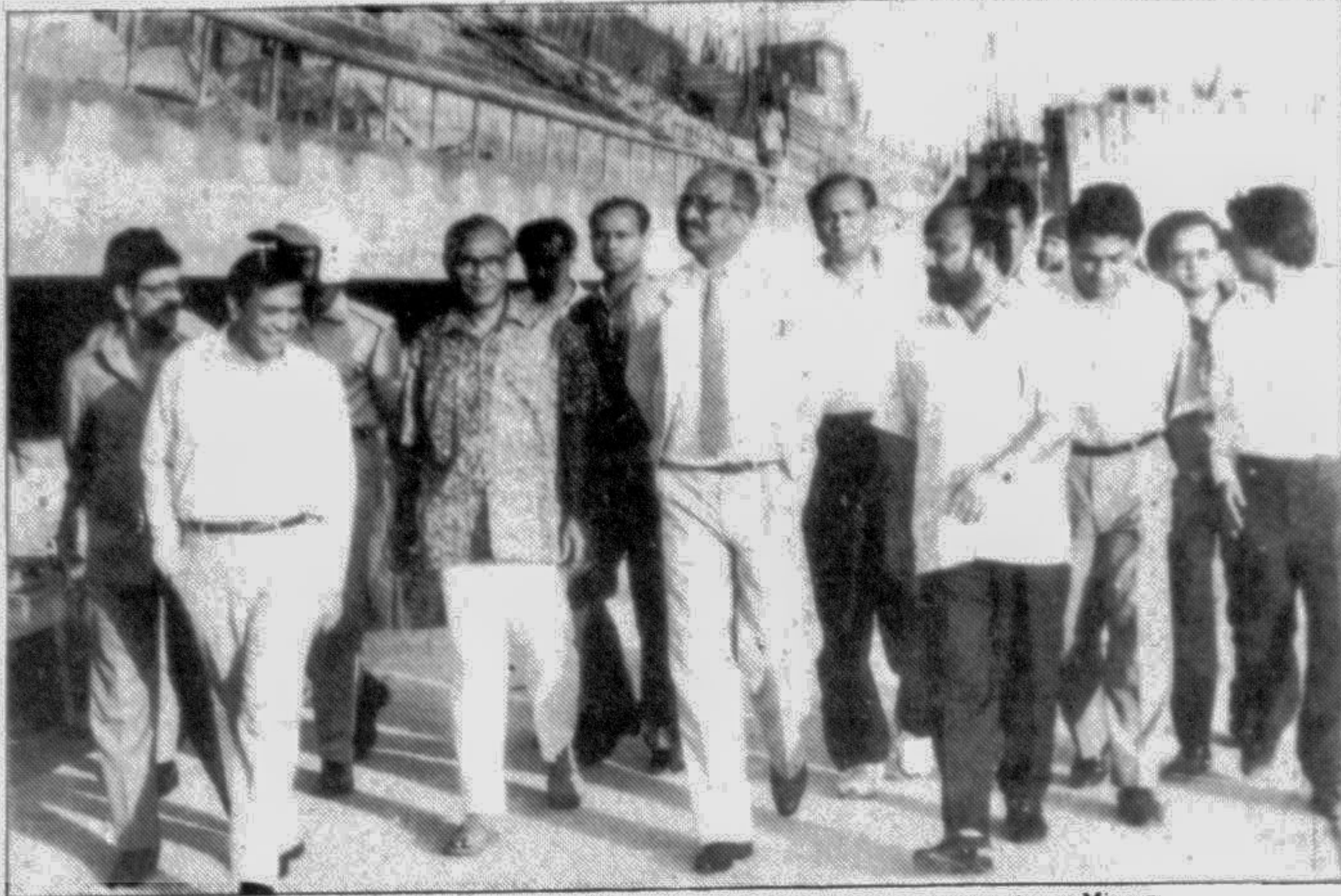
Finance Minister Saifur Rahman is being shown around the swimming pool now under construction at Mirpur.