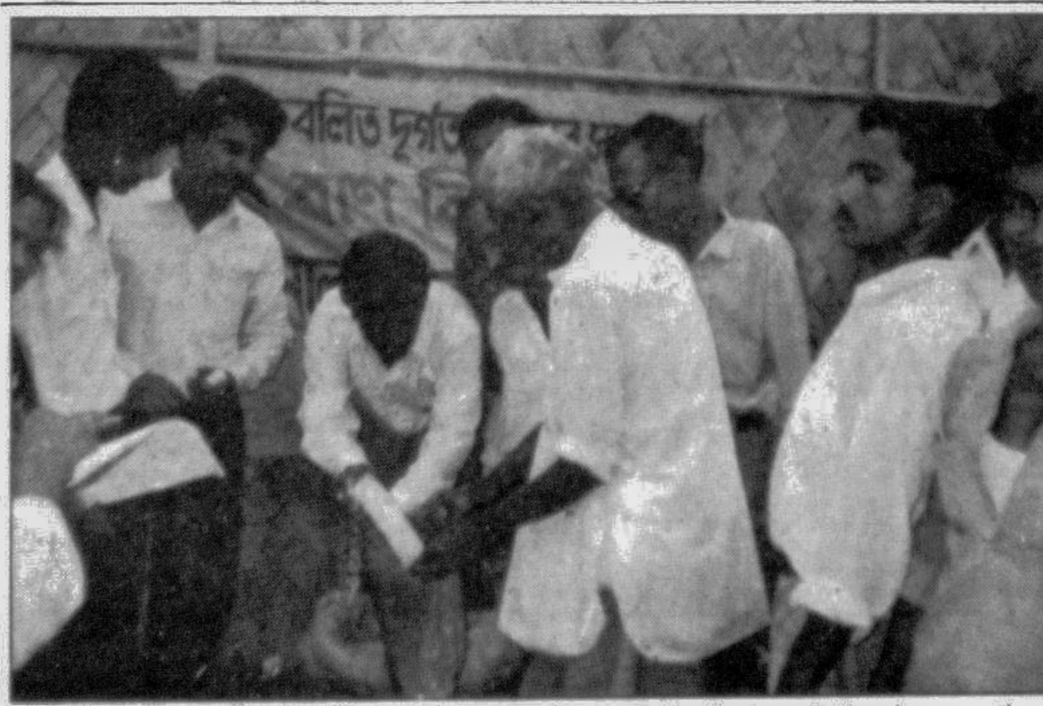
MAULVIBAZAR: Officials of National Insurance Company distributing relief goods among the flood victims of Kamalganj thana of the district recently.