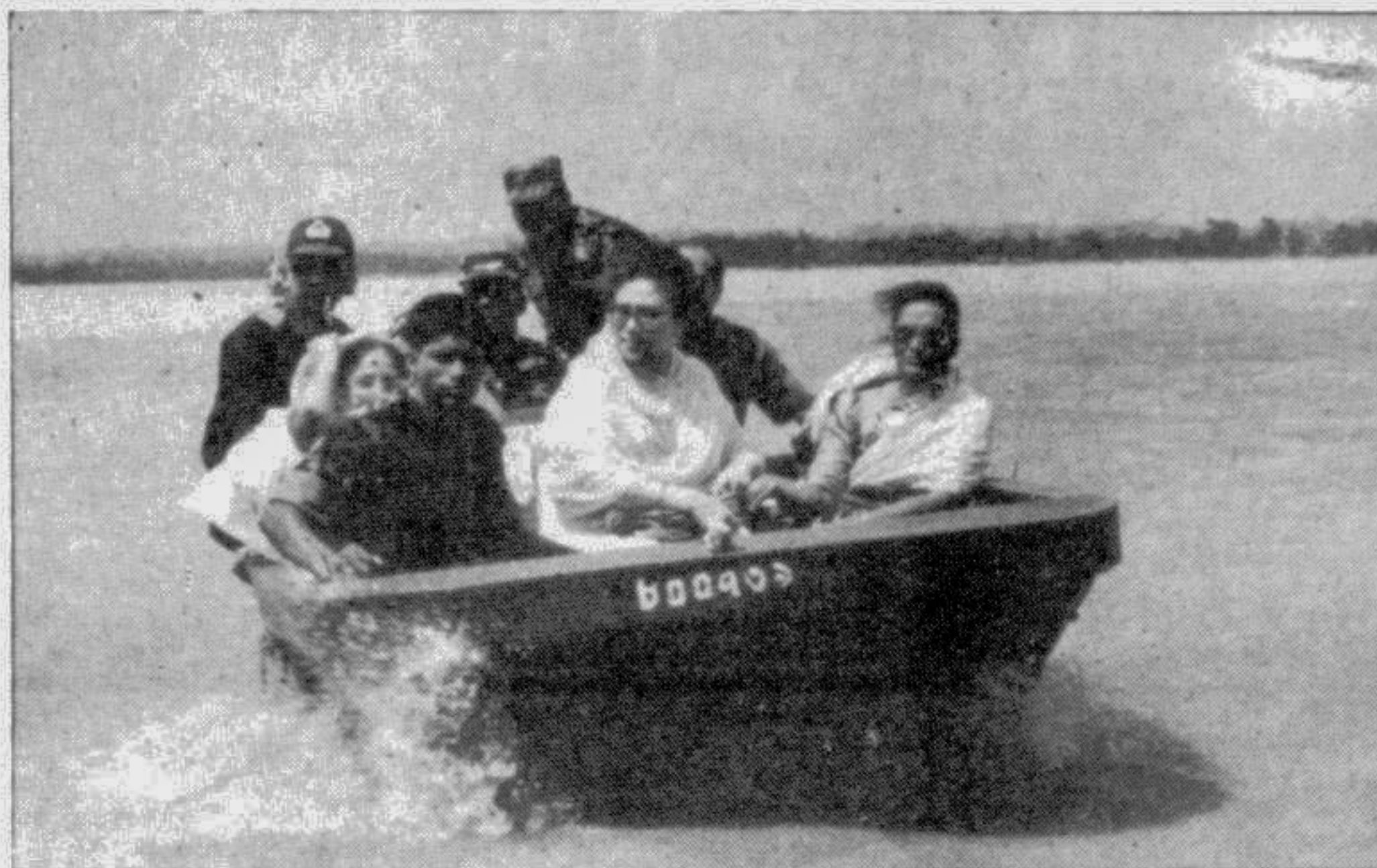
Prime Minister Begum Khaleda Zia visiting flood-affected areas of Feni district by speed-boat yesterday.