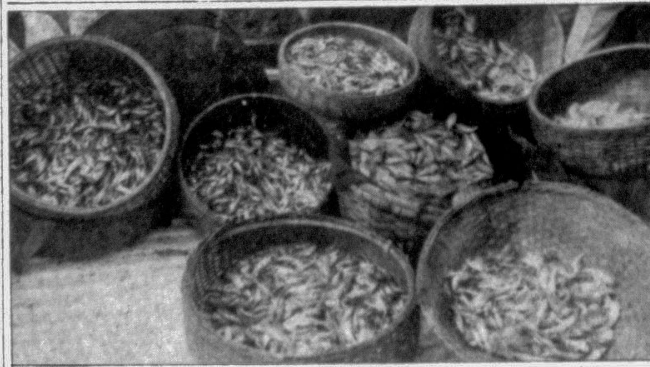
CHANDPUR : The local police recently seized the fish fry. Despite government ban, some dishonest people are found catching these which decreases fish production.