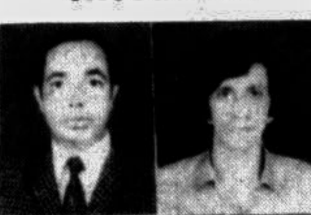
From Our Correspondent