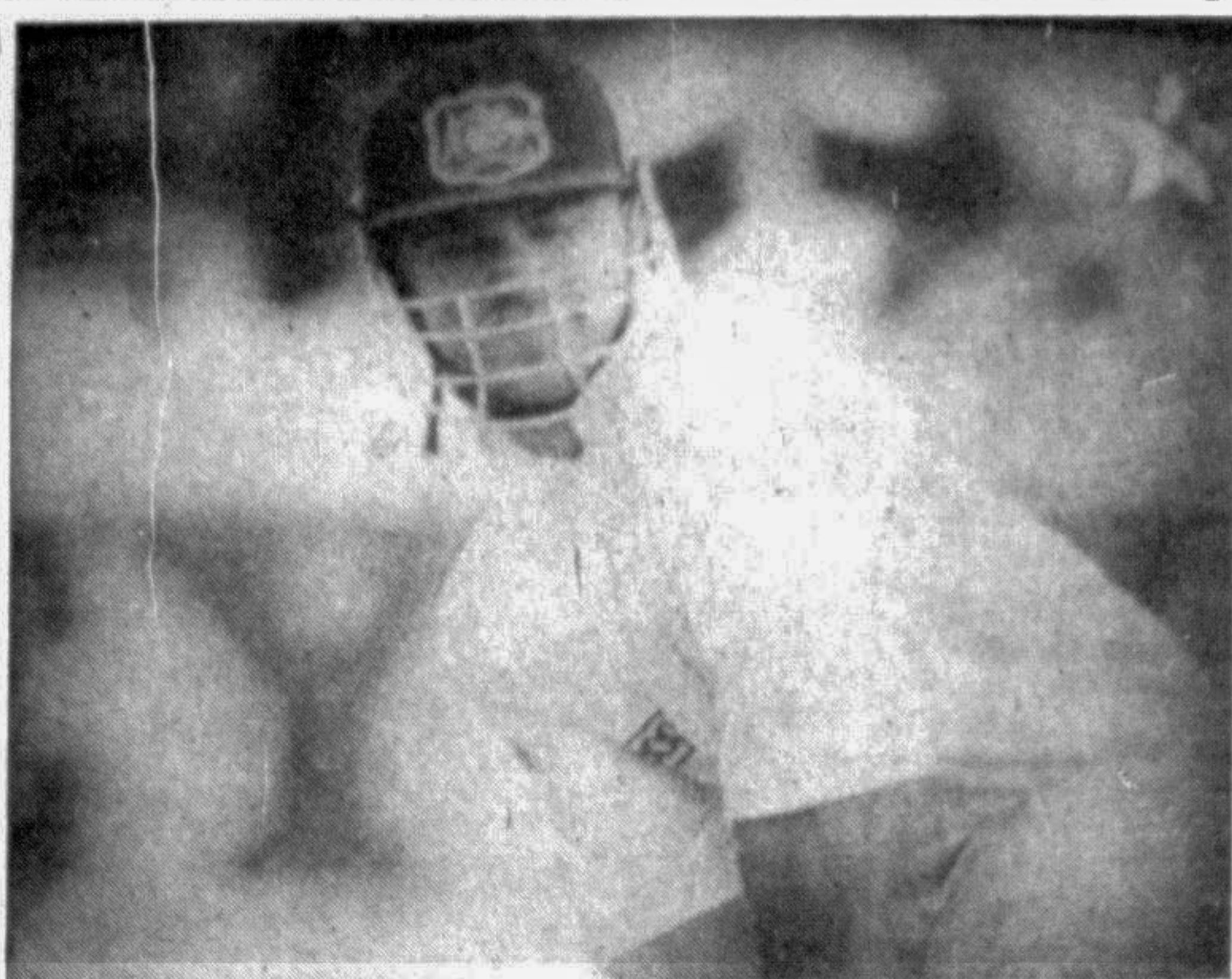
Australian opening batsman Michael Slater prepares to face a Martin McCague (not in the picture) delivery during the first day of the fourth Ashes Test in Headingley, Leeds on Thursday. Slater played confidently to notch up a fine 67.

The handsome BOA official, now embarking on a new career of an administrator as the football of the sixth SAF Games gets clearer and clearer, began his career as a first class hockey umpire way back in 1965. Having proved his worth as a competent supervisor in