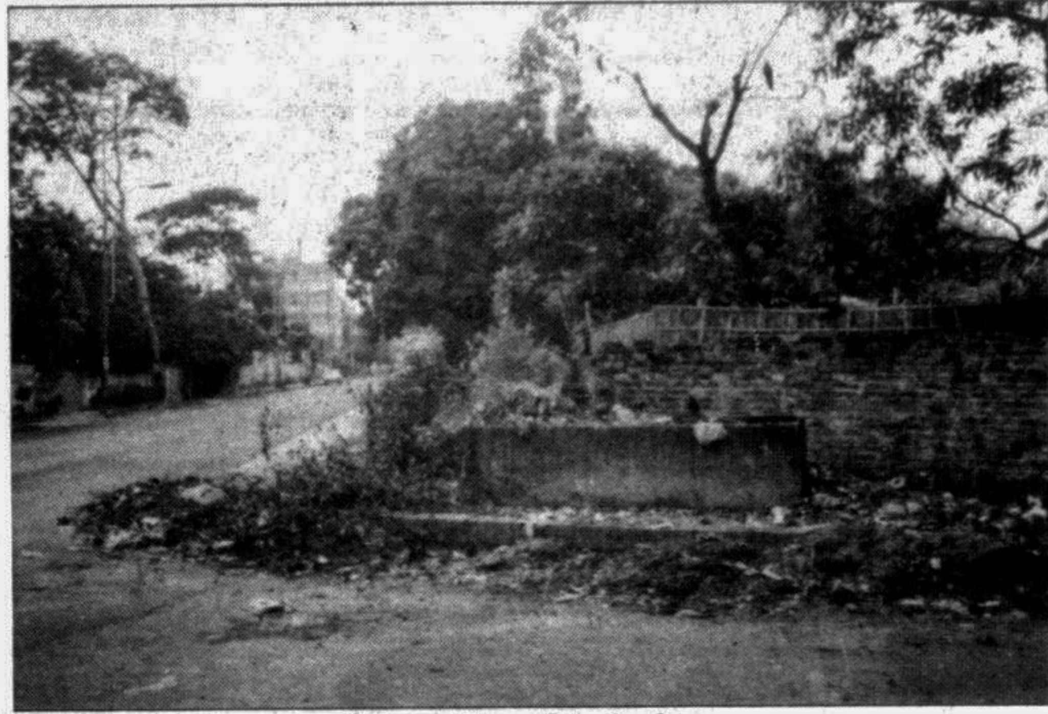
Dhanmondhis overflow of garbage

It used to be the best residential area in the city. Unlike uppity areas such as Gulshan or Banani, Dhanmondi was where neighbours actually interacted with each other and children from all the houses gathered together for a game of 'ha doo doo' or 'chiburi'. Lovers walked under beautiful Krishnachura trees while the fragrance of sheuly and gondhoraj from neatly kept gardens would intoxicate the most dulcet of minds. Now, although there are still remnants of the old Dhanmondi, the trees are still there at least, its quiet glamour has been totally marred by a flood of garbage at every corner. The fragrance of flowers has been replaced by an intoxication of another kind. Even the most besotted lovers wear ugly contorted expressions as they pass by the drains of Dhanmondi overflowing with grungy black stuff that makes the senses reel into oblivion. Recently, to prevent the blocking of the drains, the evil smelling mush has been deposited in big blobs right on the pavements. Even the slightest distraction could lead to irrevocable damage when one finds one's foot sinking into dark, smelly, slime. The open garbage dumps are the greatest menace. The residents of this township have the qualms of vultures as they happily empty their trash outside a nearby but never inside the pathetic looking cement dumpsters. Thus one finds rotting rice, soddy hay, the insides of poultry