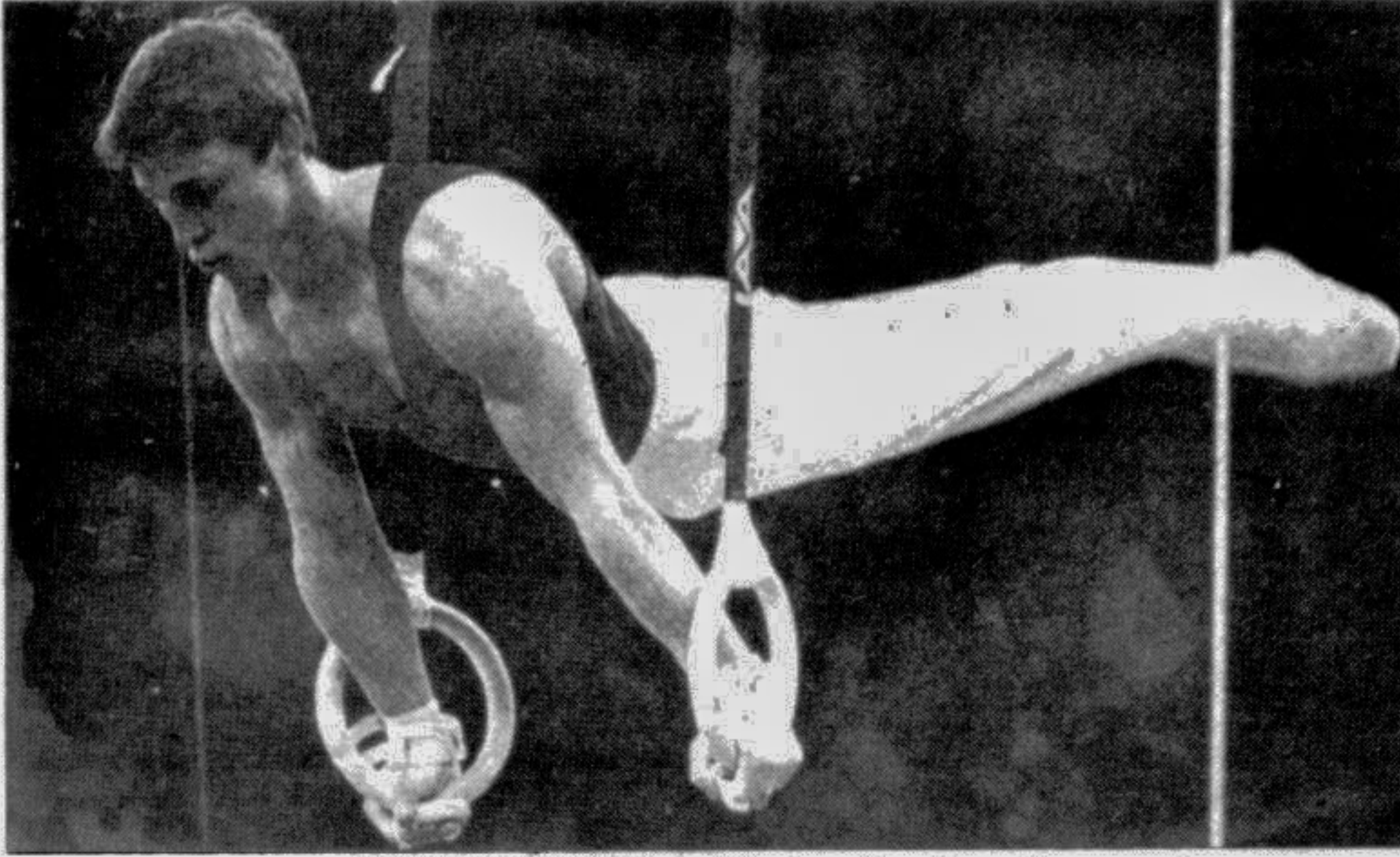
VITALY SCHERBO ... sighs more than he smiles