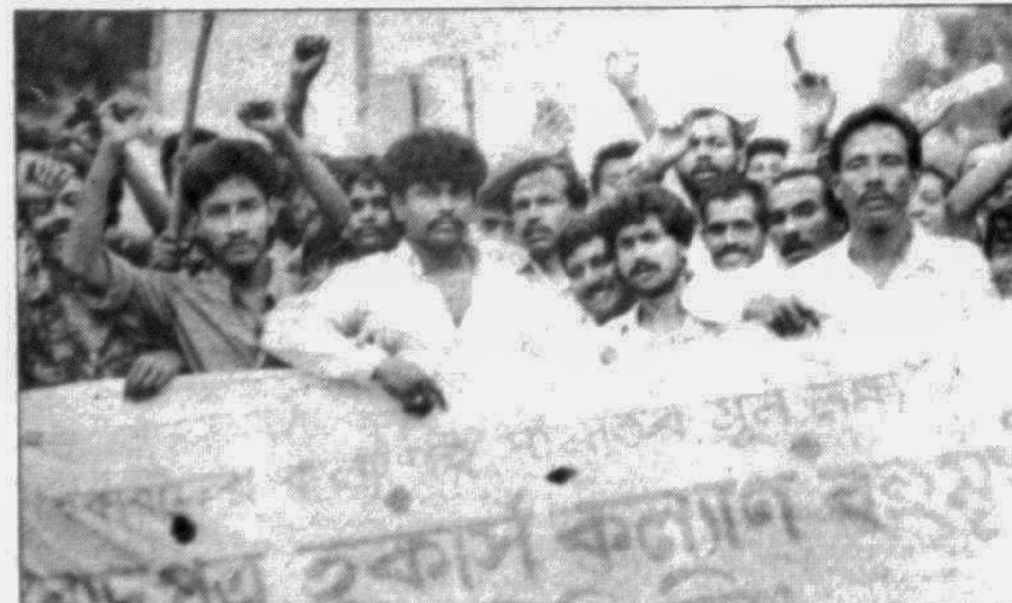
Hawk's Multipurpose Cooperative Association brought out a procession in the city protesting repression on them.