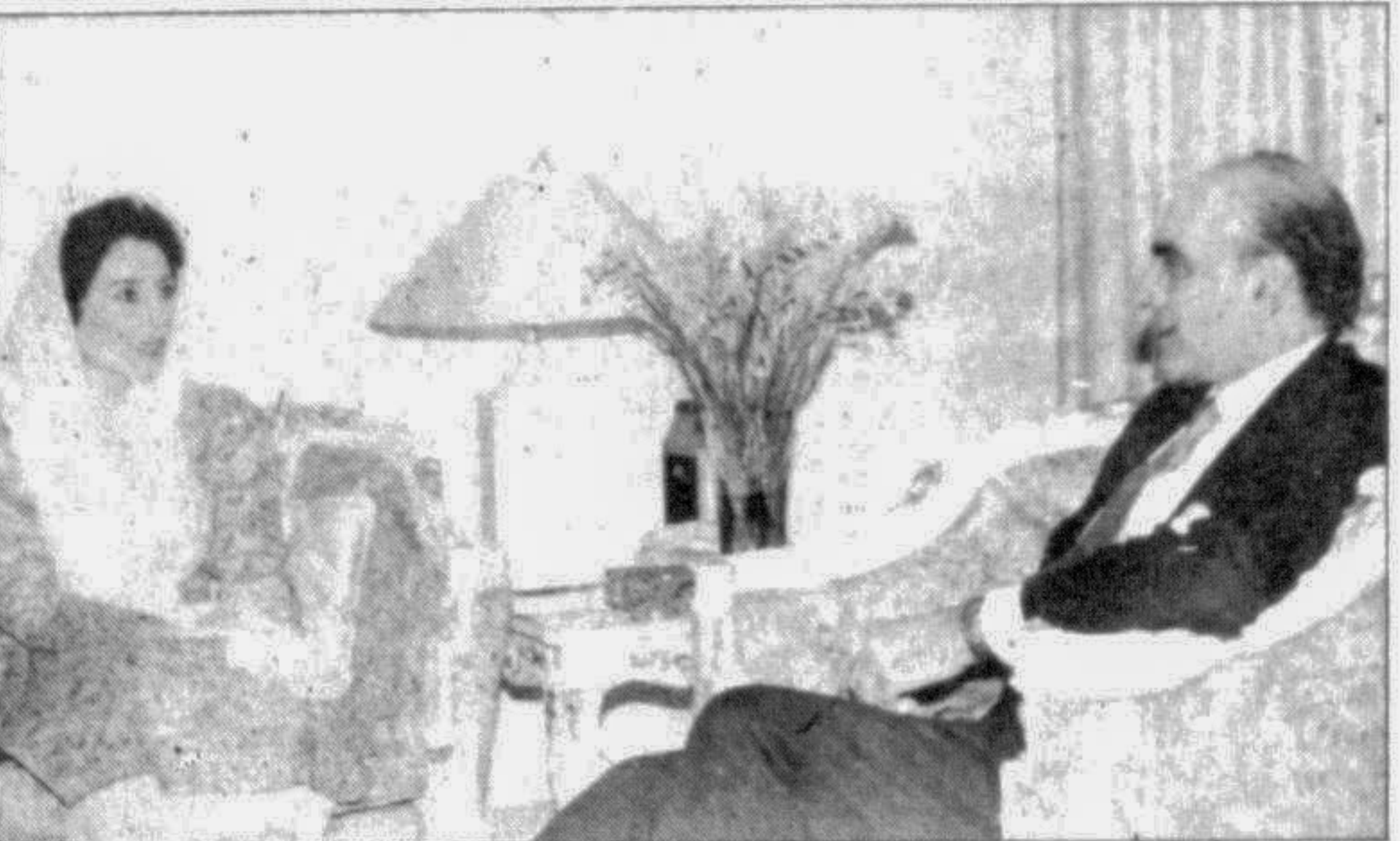
Pakistan's caretaker Prime Minister Moeen Qureshi (R) chatting with former Prime Minister Benazir Bhutto at her residence in Islamabad yesterday.

ISLAMABAD, July 20: Pakistan's caretaker Prime Minister Moeen Qureshi promised today to consider proposals for electoral reform, as he began talks with political leaders in preparation for October general elections, reports AFP. Meanwhile, the Election Commission said it would announce by August 22 a detailed programme for the polls. The Commission asked all political parties to submit their annual statements of financial accounts as required under the Constitution. Qureshi met separately with former Prime Ministers Nawaz Sharif and Benazir Bhutto, the main contenders in the coming election. After hour-long talks with Bhutto, Qureshi, sworn in only Sunday, said the caretaker government would "earnestly consider" the reforms suggested by her to guarantee impartial elections. See Page 12 Col 3