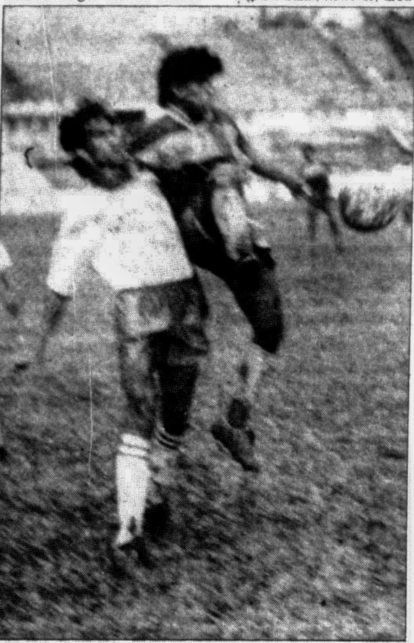
An Eskaton and an Adamjee player battle for the control of the ball in yesterday's Star First Division football league encounter at the Dhaka Stadium.

Victoria Sporting Club and Agrani Bank shared points in a goalless, literally mudsting encounter of the Star Premier Division football league at the Dhaka Stadium yesterday.