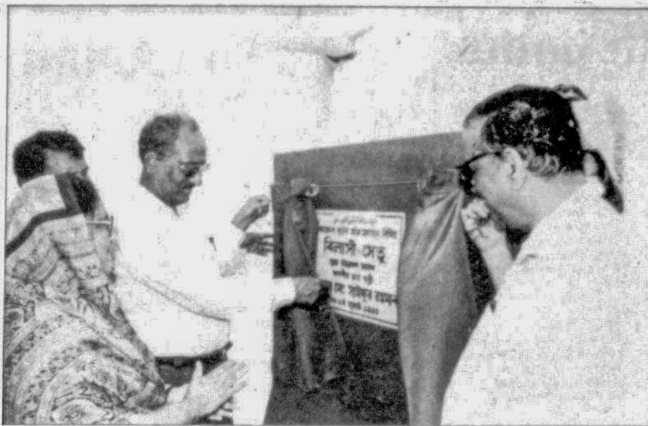
Finance Minister M Saifur Rahman laying the foundation stone of Bilashi Bridge on Dhaka-Sylhet Highway recently.