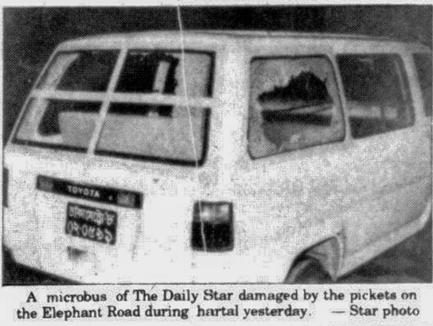
A microbus of The Daily Star damaged by the pickets on the Elephant Road during hartal yesterday.