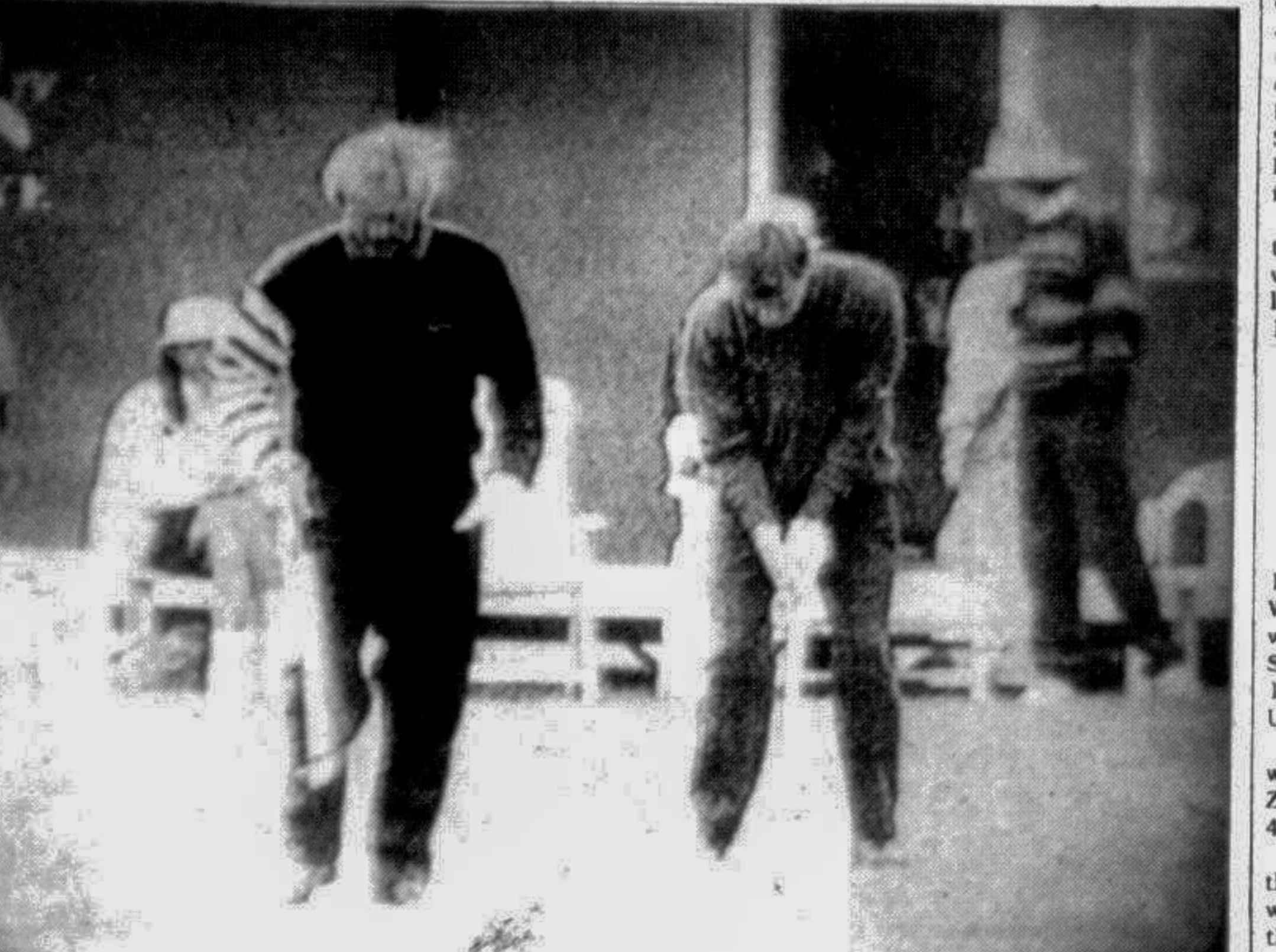
Nick Faldo (R) and one of the participants having a brief practice session before the start of the final rounds of the 122nd British Open golf championship on Sunday.