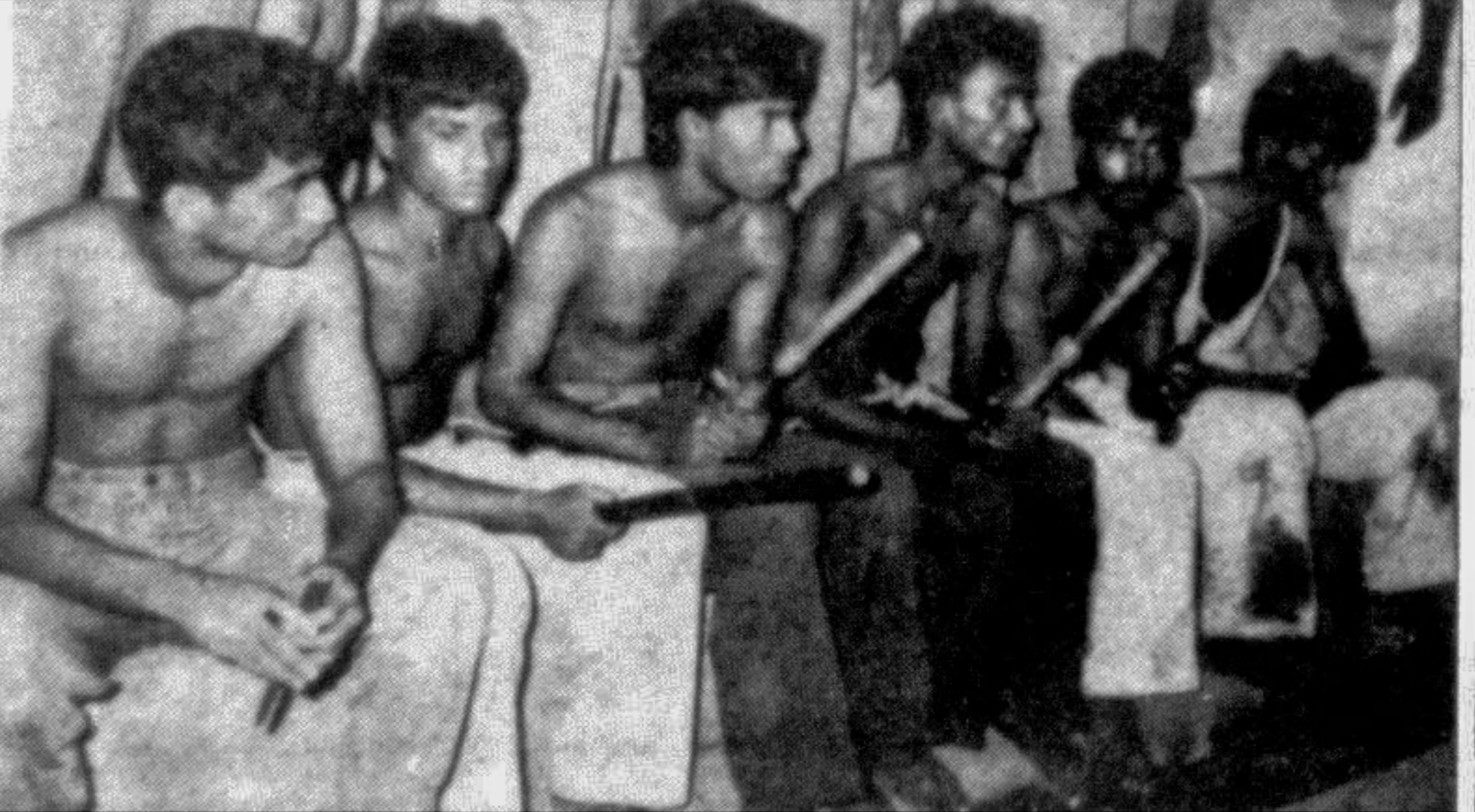
JHENIDAH: Kaliganj police arrested the six dacoits from a night coach near Barobazar recently. Police also recovered huge quantities of arms and ammunition from their possession.

A big procession was brought out after the rally, which passed through main city roads.