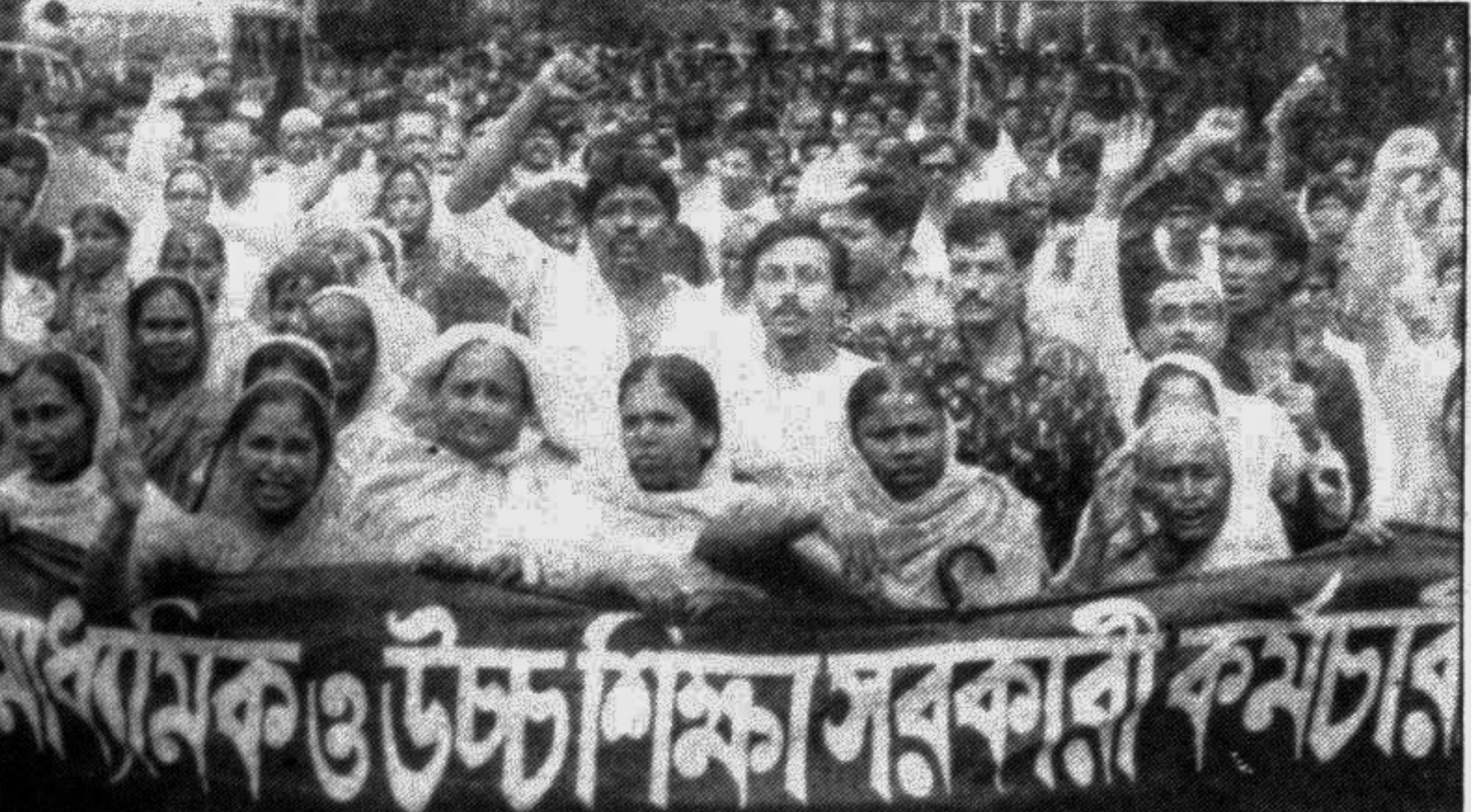
Employees of Secondary and Higher Secondary Schools and Colleges brought out a rally in the city in support of their 7-point demand.

A case has been filed with the Shahjibagh police station in this connection.