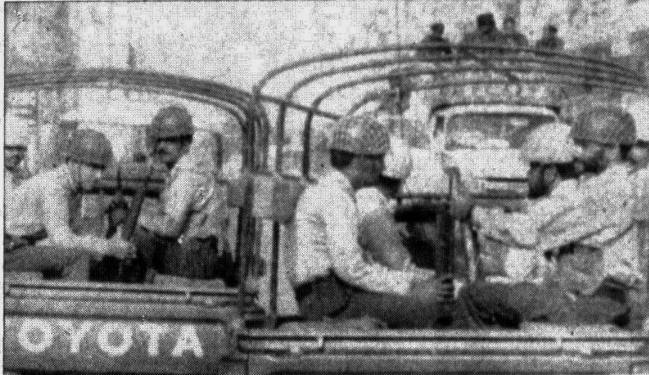
Pakistani army and police patrolling the streets of Karachi Wednesday to avert any violence as arrests continue in Karachi and Hyderabad for the third consecutive day. In the last three days 10 vehicles and two government offices have been burned by the Mohajir Quami Movement (MQM) activists.

Three students each from the Dhaka and Tejaon colleges were injured in the hour-long fracas. Meanwhile, a large contingent of police was deployed near the Tejaon College area.