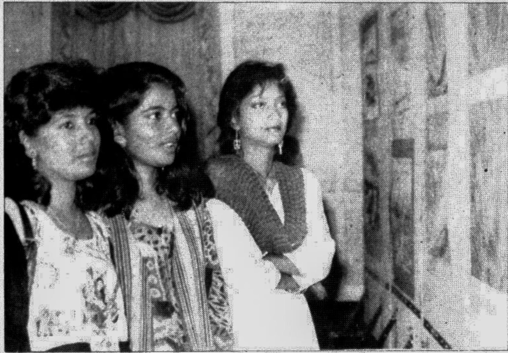
Viewers admiring the exhibition at Sheraton.

An exhibition of 170 water colours was held at Sheraton recently. Most of the subjects were Bangladeshi landscapes, which were selected on purpose to acquaint the foreign visitors with the beauty of the countryside. The purpose was to promote the promising but not so well known artists of Bangladesh. Many of them were amateurs, some students while two of the participants were deaf and dumb.