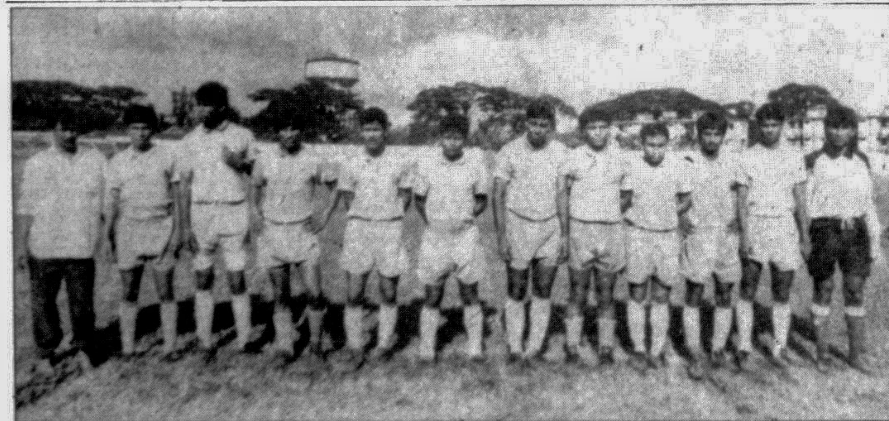
The players and an official of Abahani Krira Chakra who emerged champions in the Sylhet First Division football league, organised by the Sylhet District Association.

Players from 19 countries would compete in the five-day tournament.