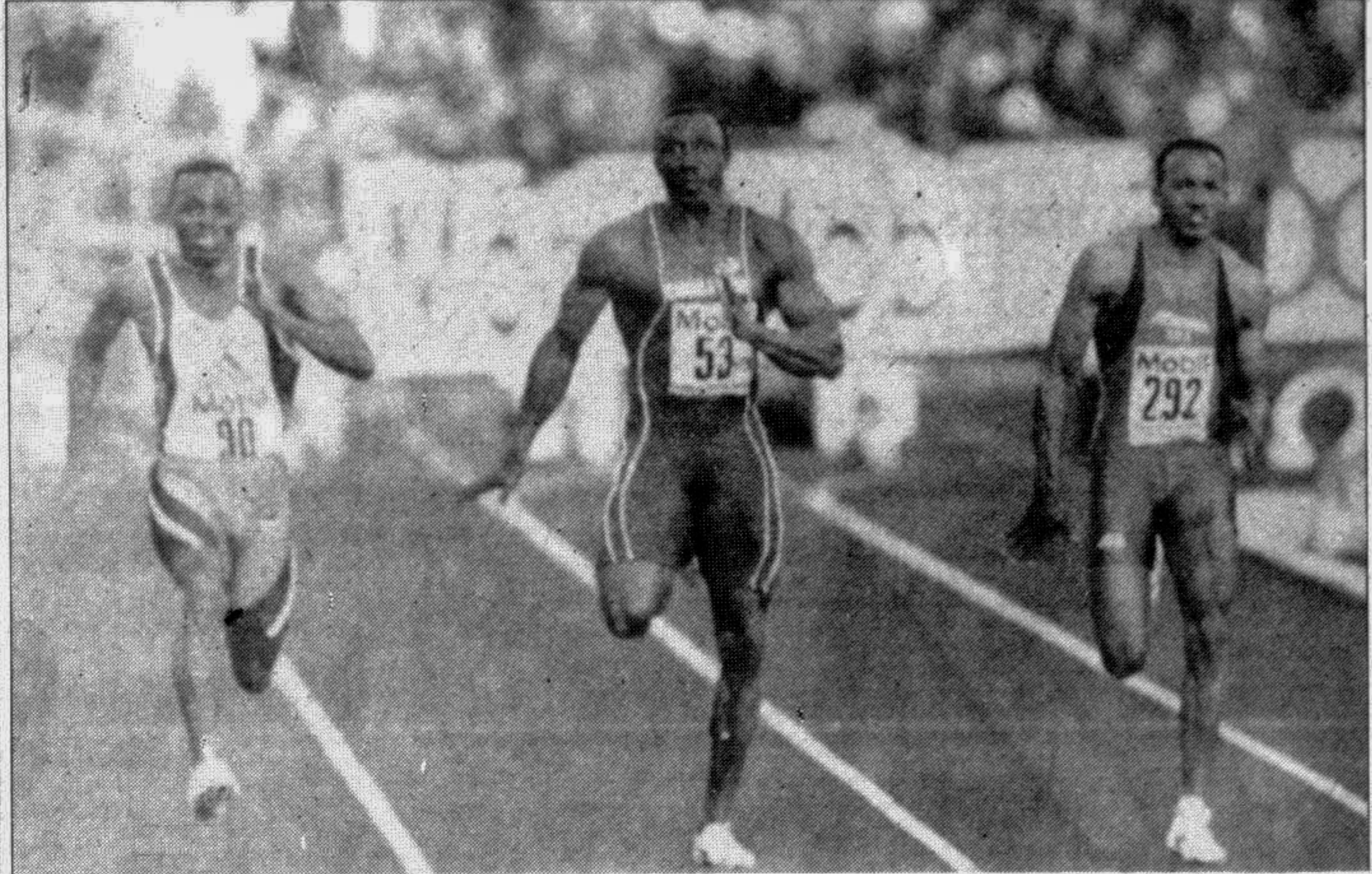
Olympic gold medalist Linford Christie of Great Britain (C) leads Namibian Frank Fredericks (R) and American Michael Green during the men's 100m dash in the Bislett Games in Oslo on July 10. Christie clocked 10.09 to win the gold ahead of Fredericks and Green.

The 20-year-old Czech, world-ranked 64th, proved the better of the Canadian-born champion of the past two years, who made too many unforced errors.