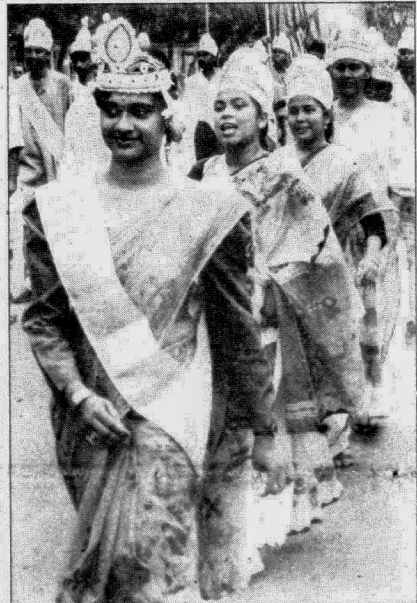
The Bangladesh Samannaya Abriti Parishad brought out a colourful procession in the city yesterday to mark the start of the fourth national recitation festival.

The raid sparked the revenge killing of at least two foreign journalists.