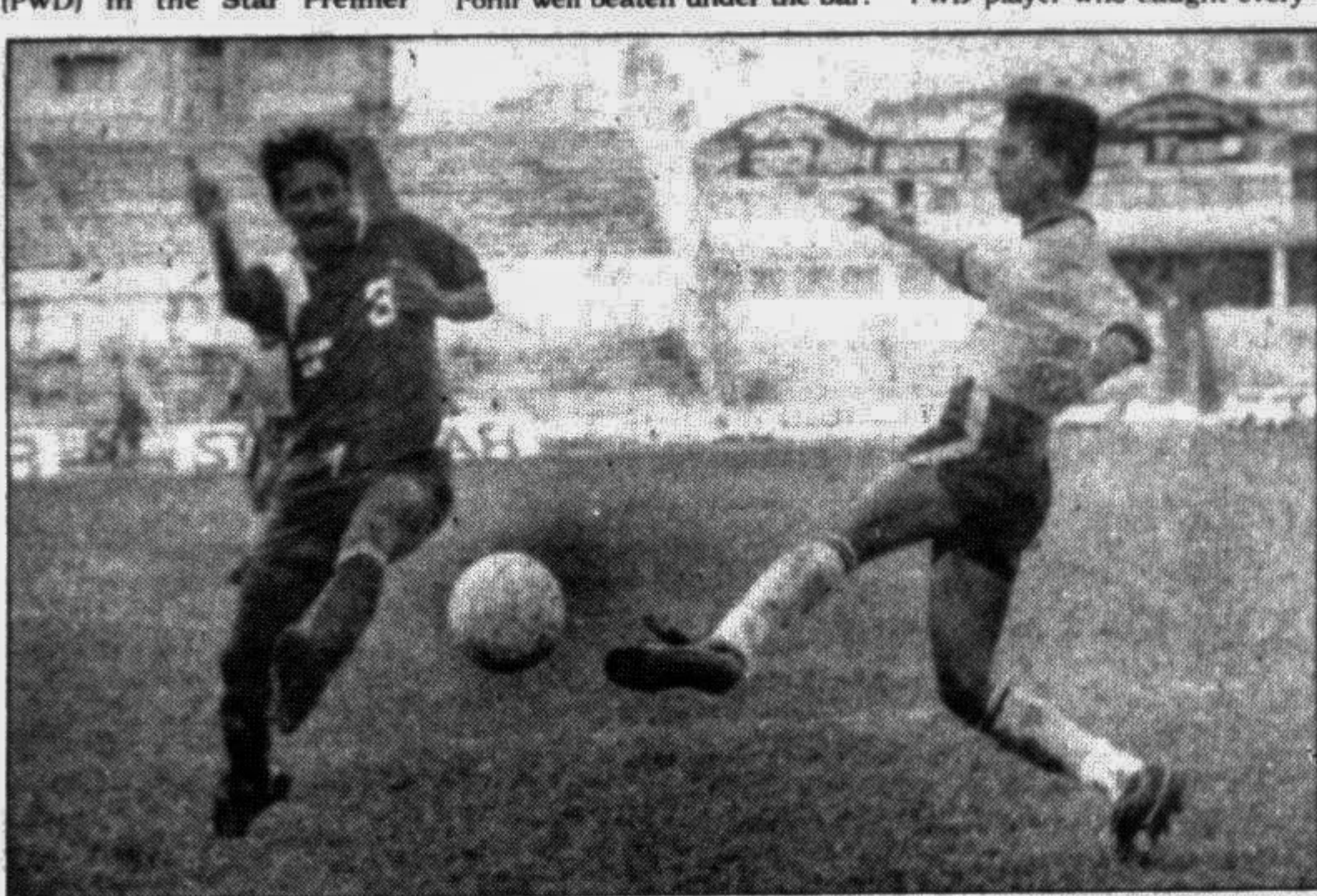
Action from yesterday's Star First Division football league encounter between Dhanmondi and East End. The match ended in a goalless draw.