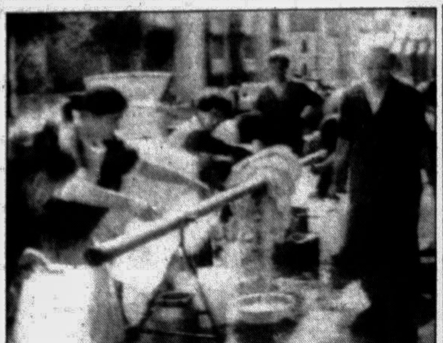
Acute shortage of water has made life miserable for the residents of Sarajevo who are seen using sewer water.

'They have proved, by their activities in and outside the House, that they do not want Parliament to function,' he said. 'Demands will not be fulfilled through unnecessary siege and by destroying the country's resources,' she said, questioning if the trade union laws permit such activities like taking people hostage. 'Whose interests are they serving?' the Prime Minister asked, and urged all to maintain proper trade union activities and work for building the country. In response to opposition remarks that the BNP government has lost the people's support, the Prime Minister, also chairperson of the ruling party, asserted: 'We are in power with the cooperation and support of the people.'