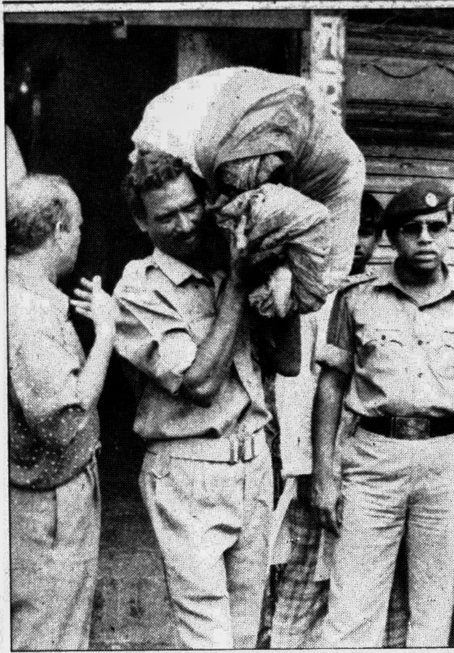
Customs and VAT officials seized 1400 pieces of Indian sarees worth about Tk 5 lakh from the Bangabazar market in the city yesterday.

NARAYANGANJ, July 10: A series of bomb blasts rocked the port town tonight following an attack on two leaders of Awami League-backed Chhatra League, reports UNB. Witnesses said more than a hundred bombs were exploded in different parts of the town after activists of Awami League and its front organisations took out a procession protesting the attack. Shops were shuttered and movement of vehicular traffic came to a halt as the people ran helter skelter for safety. The bomb explosions continued from 7 pm to 11 pm until police intervened and brought the situation under control. Tension was mounting in the town and police were posted at different points to guard against further violence. Local Awami League unit filed a case with the local police, holding BNP leaders and workers responsible for the incident.