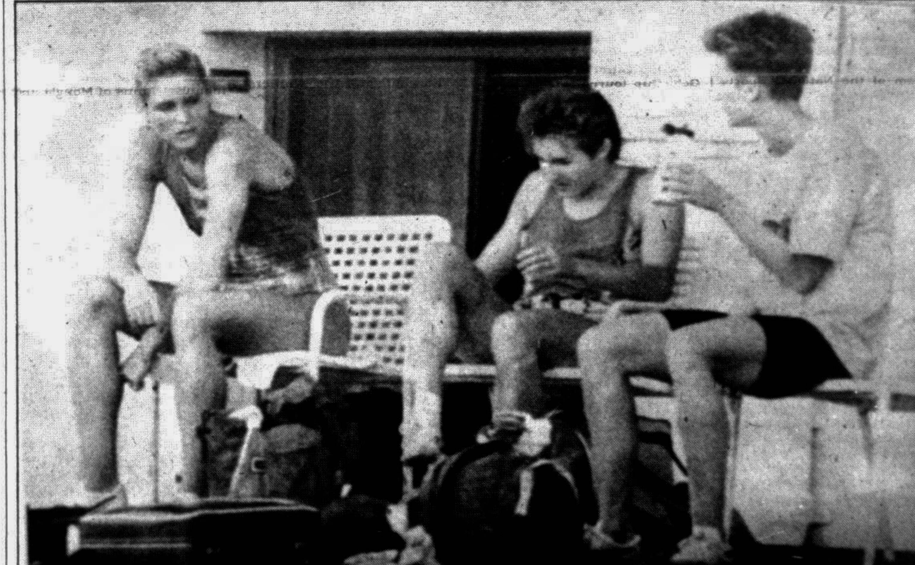
Star file photo shows (from left to right), German double world sprint champion Katrin Krabbe, and her compatriots Manuela Derr and Grit Breuer taking a break during a practice session. DLV on Friday called for a rapid decision regarding their ban for using Clenbuterol.

Other incentives including ones based on timing, weather and age are available to all nationalities.