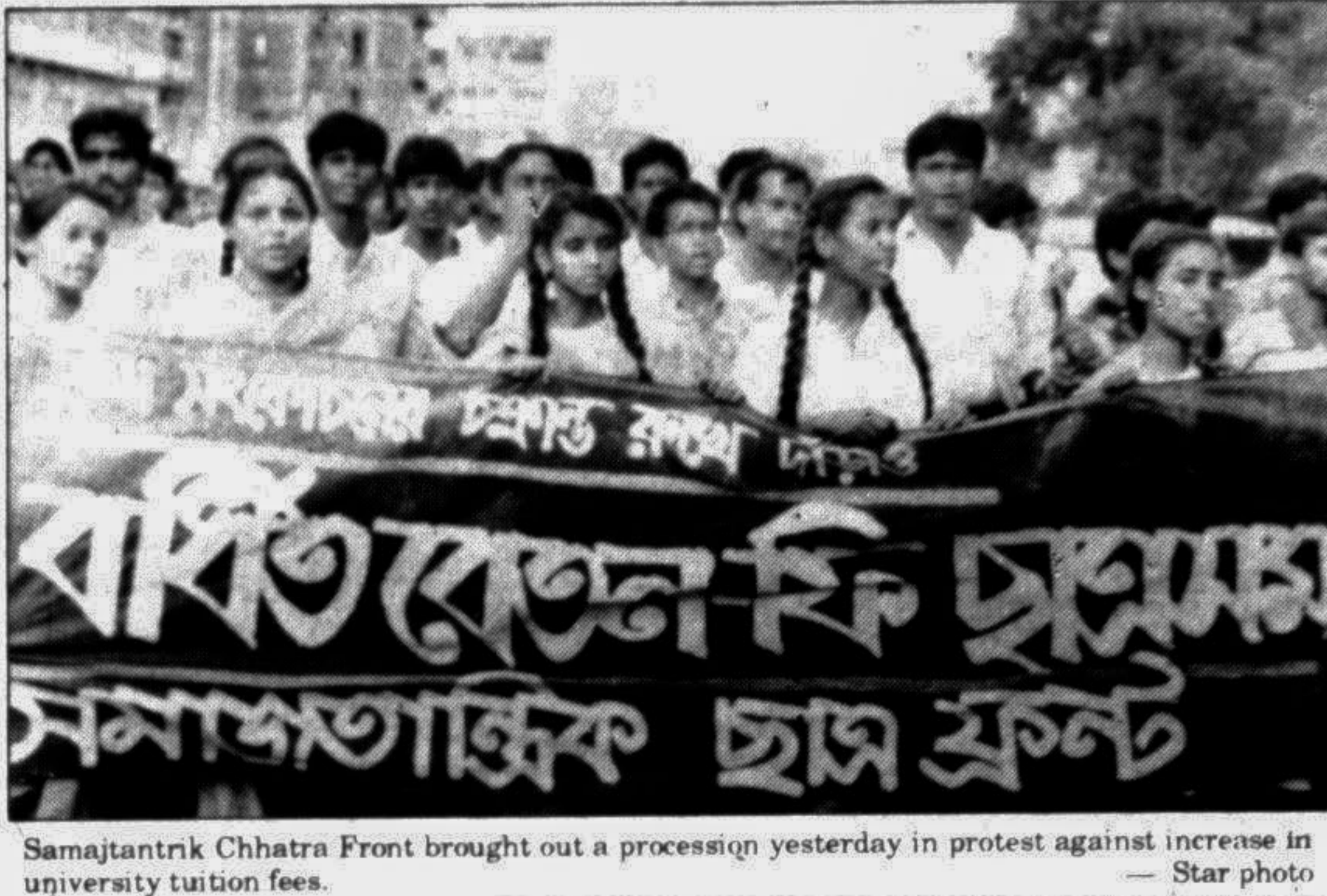
Samajtantrik Chhatra Front brought out a procession yesterday in protest against increase in university tuition fees.

It may be mentioned that the CPB split last month.